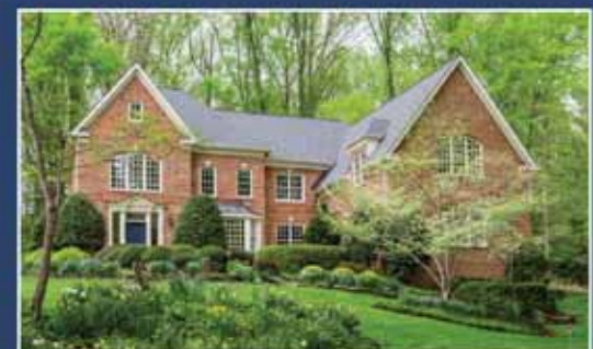
Great Falls $1,499,000