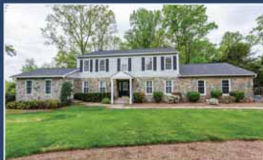
Great Falls $1,140,000