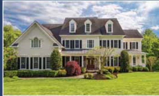
Great Falls $1,700,000