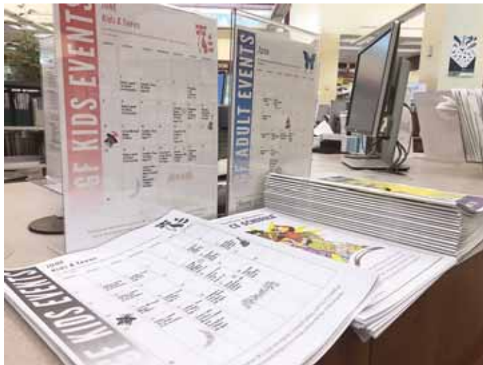
As part of the program, the Great Falls Library will host events, like musical performances and an ice cream social throughout the summer for participants.

FOR A COMPLETE SCHEDULE of programs and more on the summer reading challenge, visit fairfaxcounty.gov/library .