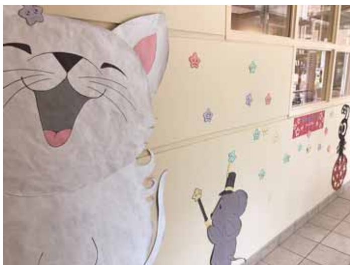
Participants can display their name in many areas of the Great Falls Library – even a Lego area.