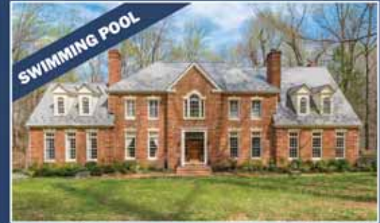
Great Falls $1,699,000