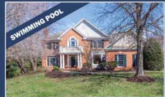
Great Falls $1,399,000