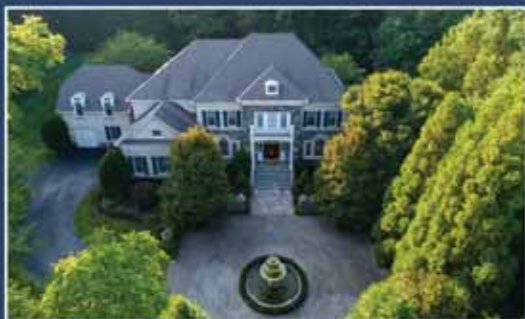
Great Falls $3,499,000