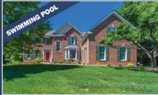
Great Falls $1,299,000