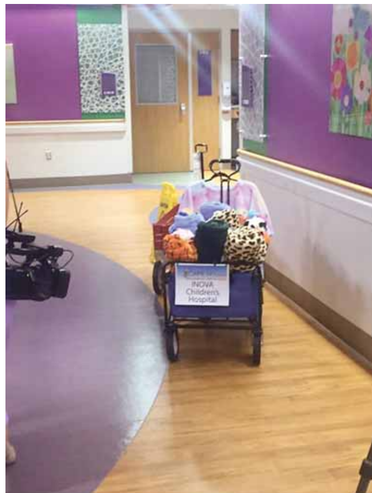
CapeIvy.com's "cape wagon" provides colorful ponchos to hospitalized children. The Child Life staff at the hospitals receive the ponchos to distribute to children with illnesses that cause them to visit hospitals often. At INOVA Children's Hospital, several patients selected their favorite poncho from the wagon.

Same Company, Same Employees, Same Great Value - Now Celebrating 20 Years!