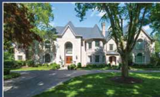
Great Falls $3,699,000