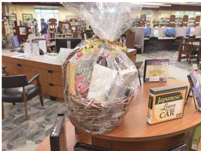
The Great Falls Library will raffle autographed books and other items for some finishers of the challenge.