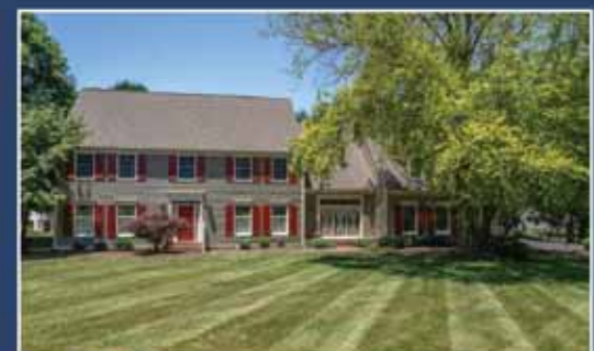
Great Falls $1,199,000