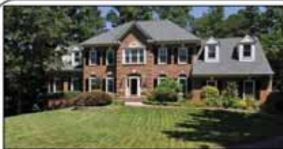
FAIRFAX STATION / CROSSPOINTE