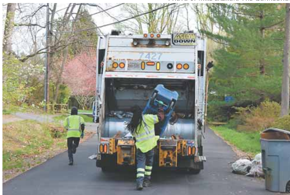
In Fairfax County, private collection companies pick up trash and recycling for ninety percent of residents and businesses while the county trash service is only responsible for 10 percent.

In Fairfax County, private collection companies pick up trash and recycling for ninety