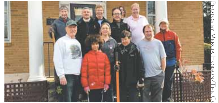
Friends gather after a long cold December day in 2017 during which they placed native plants in their new garden.