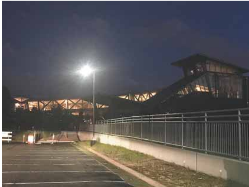
The Herndon Station on the Silver Line on Metro offers opportunities which could lead to workforce housing options at the higher density Herndon Station and Innovation Station.

According to Virginia Housing, workforce housing is housing for the occupations needed in every community- teachers, firefighters, police officers, hospital workers, restaurant workers and more. Some workforce occupations such as foodservice and retail sales are likely to be in the lower-income range, whereas workforce occupations with education or training requirements such as teachers, police officers and nurses, generally rise to median income levels and above.