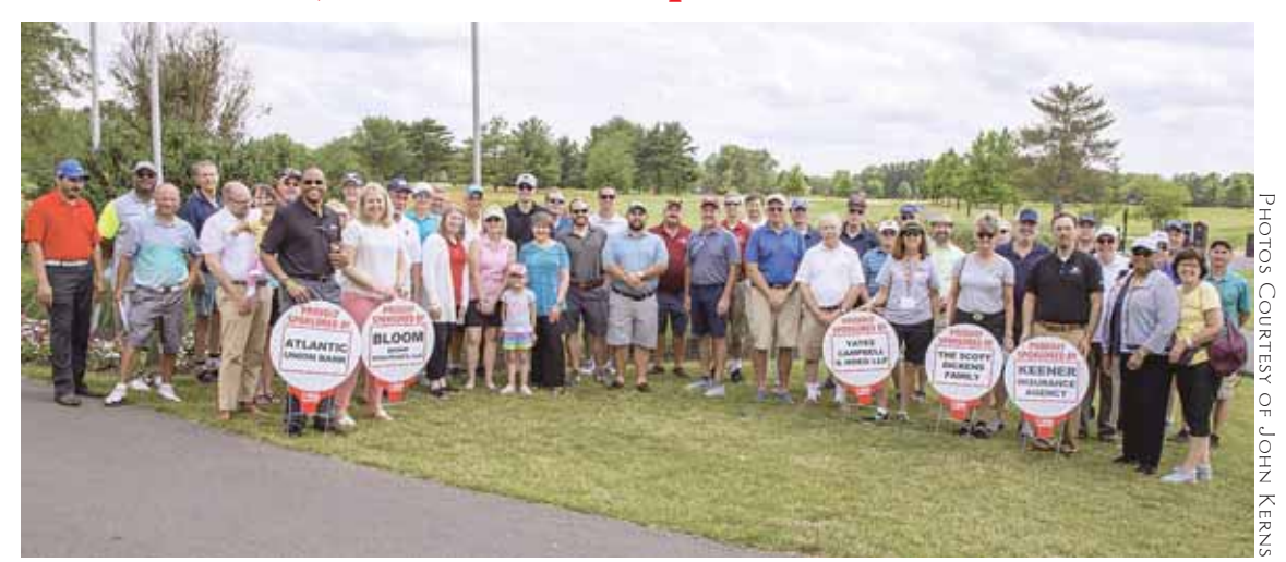
Many of the golfers, sponsors, volunteers and WFCM board members who attended the fundraiser.

"We provided over $250,000 in rent and utility assistance to nearly 500 families facing eviction or disconnection of services," she explained. "And in addition to giv-