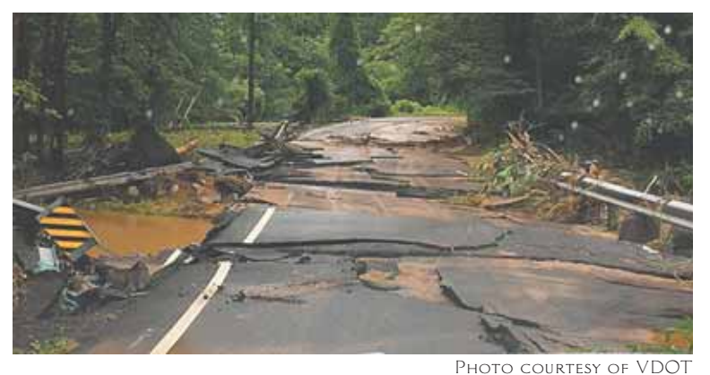
Bridge damage on Swinks Mill Road.

ByJuly 25, the flood repair strike team repaired twelve roads since the floods. The team focused on milling, paving, and shoulder repair on Barbee Street, Benjamin Street, Beulah Road, Churchill Road, Georgetown Pike, Ironwood Drive, Morningside Drive, Leigh Mill Road, Lorraine Avenue, Prosperity Avenue, Thrasher Place, and Valley Wood Road. All twelve roads were repaired in five days. Bridge maintenance crews are continuing to remove debris from around and under bridges and in-