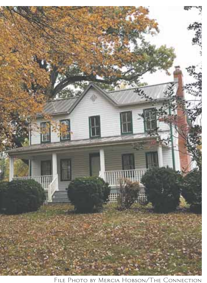
Ellmore Farmhouse within Frying Pan Farm Park, 2739 West Ox Road, Herndon, Hunter Mill Supervisory District, Owner: Fairfax County Park Authority.

In the other cover letter and completed application, Applicant #2 stated: "After rehabilitation and renovations are completed, ServiceSource proposes using the Ellmore Farmhouse as a "launchpad" for one of our Long-Term and Community Integration Services (LTCIS) programs. A group of approximately 15 people with disabilities and staff will gather at the Ellmore Farmhouse from 8 a.m.-4:30 p.m. Monday-Friday... ServiceSource has a 47-year history of providing high-quality, innovative programming in Northern Virginia. In FY 2018, we served more than 4,000 people with disabilities through long-term and