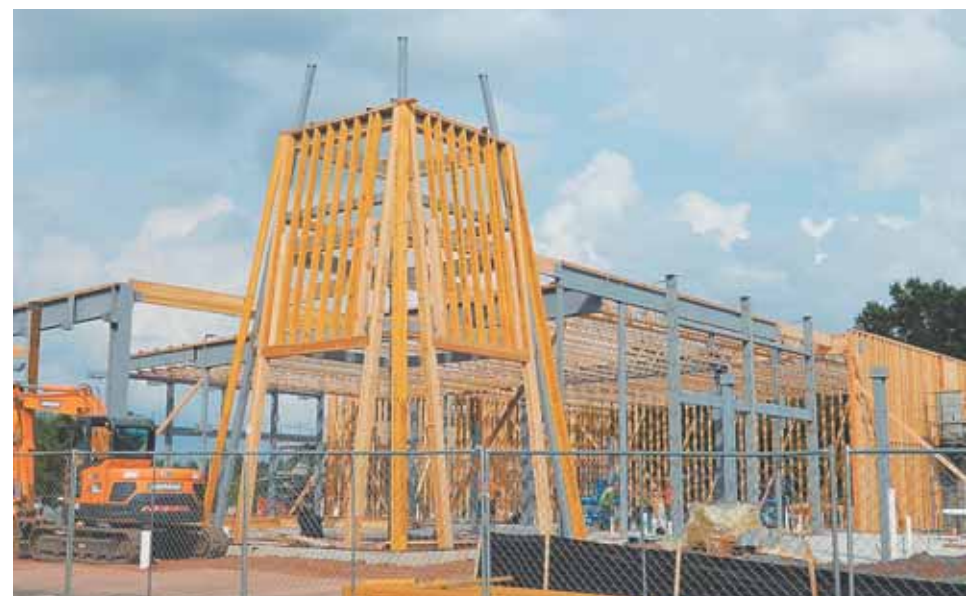
The Lazy Dog Café is under construction in The Field at Commonwealth shopping center.