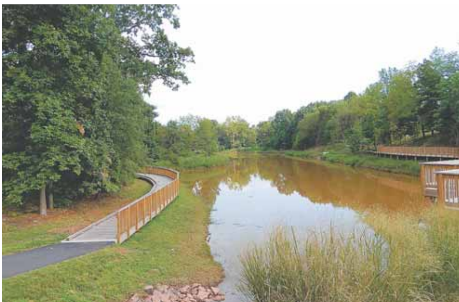
Walking trails are on both side of this lake at The Preserve at Westfields.

Some 50 acres of formerly-vacant land along Route 28 and Stonecroft and SEE LOCAL HORIZON, PAGE 4