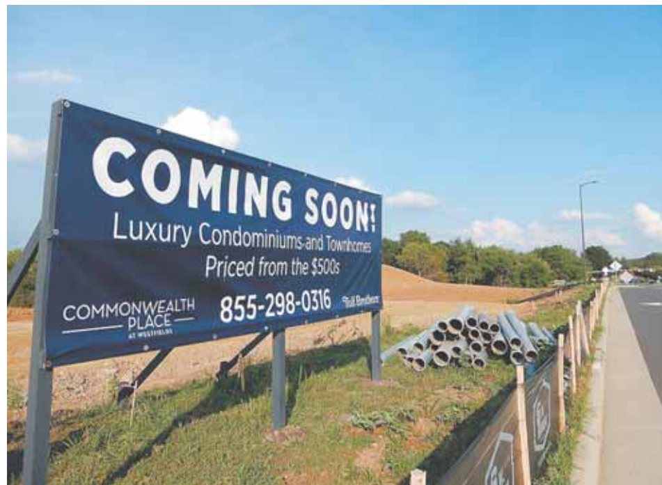
A large, residential and retail project, Commonwealth Place at Westfields is being built along Newbrook Drive.

Fairfax County is building the Sully District Community Center on a 5-acre site at the intersection of Wall Road and Air and Space Museum Parkway in Chantilly. The roughly 34,000 square-foot building will serve as a multigenerational center for the