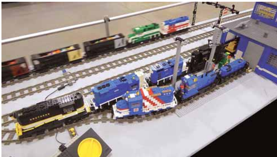
LEGO model train displays by Monty Smith.

Kids Wish Kids Good Night. 7-8 p.m. at Frying Pan Farm Park, 2709 West Ox Road, Herndon. Put a new twist on the bedtime routine by letting children wish a good night to the animals at Frying Pan Farm Park. Bring a flashlight or lantern for this twilight tour and learn how farm animals settle down for the night. For