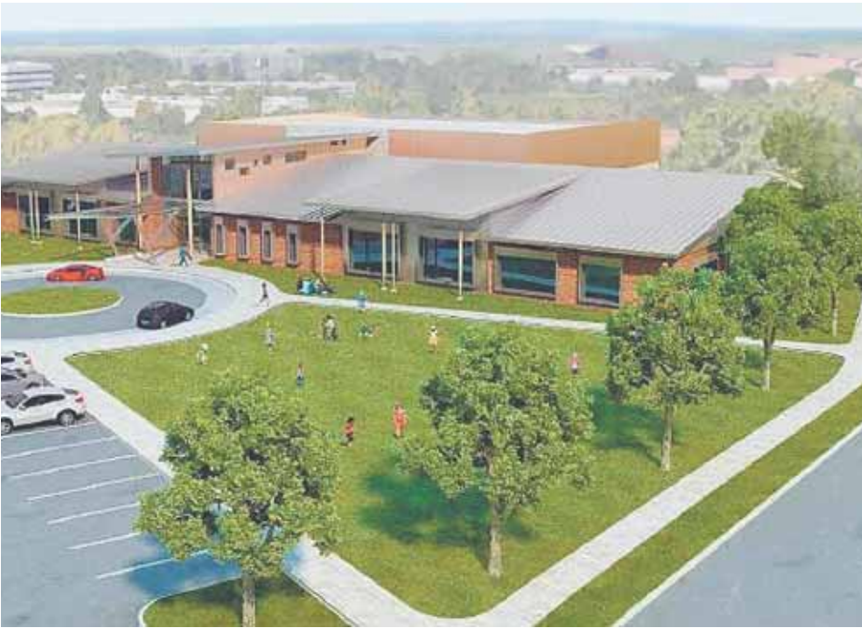
Artist's rendition of the Sully District Community Center in Chantilly.