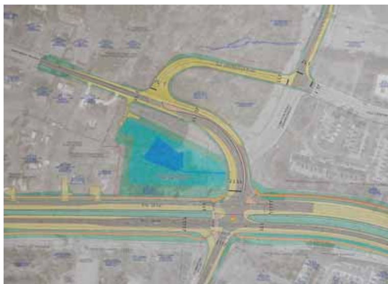
The intersection of Ordway, Compton and Old Centreville roads is a particularly important part of the Route 28 widening project.