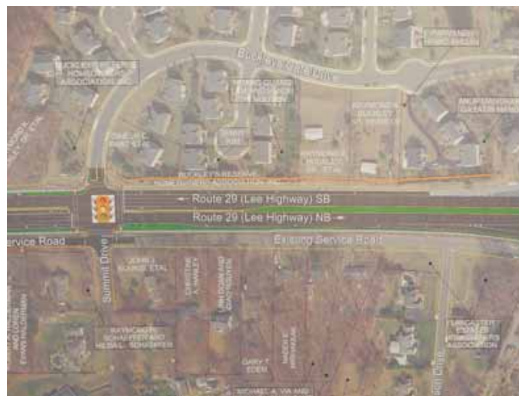
Route 29 will be widened from four to six lanes between Buckley's Gate Drive and Union Mill Road.