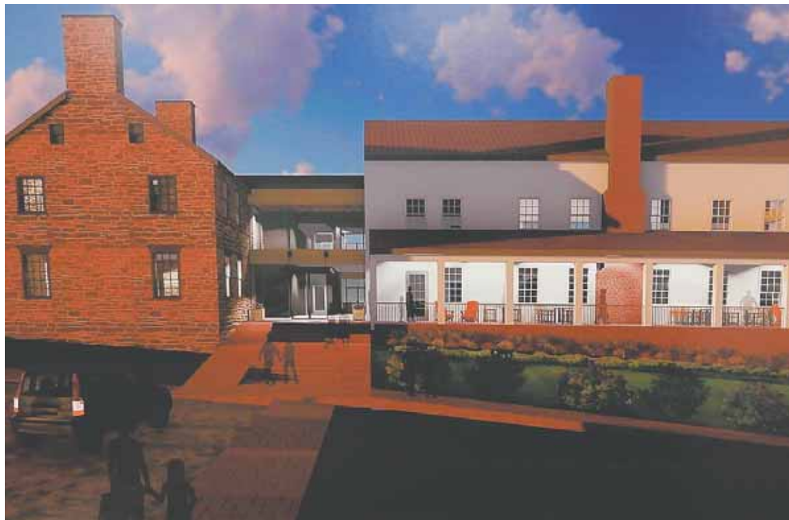
Artist's rendition of the Bull Run Farm Brewery in Centreville.

Now, workmen are busily building the Lazy Dog Cafe across from pizza place Mellow Mushroom.