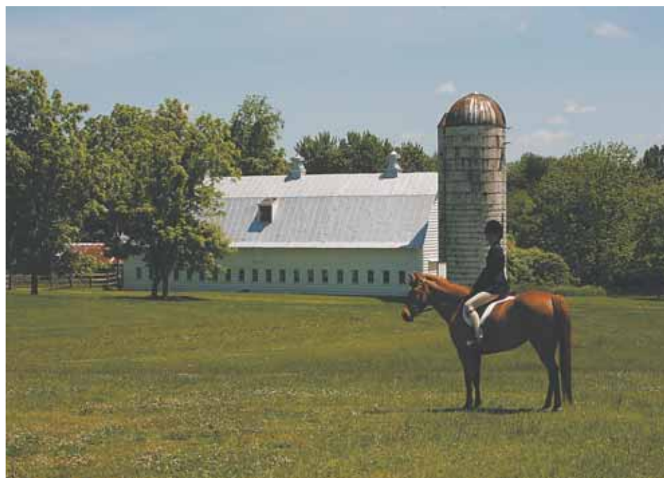
Turner Farm Park