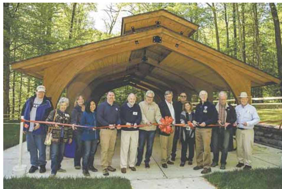
Fairfax County Park Authority representatives, and community members celebrated the opening of the Outdoor Education Classroom/Picnic Shelter at Riverbend Park.

partment of Transportation will relocate and improve the crosswalk on Parcher Avenue near Hutchison Elementary School's entrance. The crosswalk will be moved to the other side of the driveway where visibility is better and a pedestrian refuge median will be added. The project will be completed this fall.