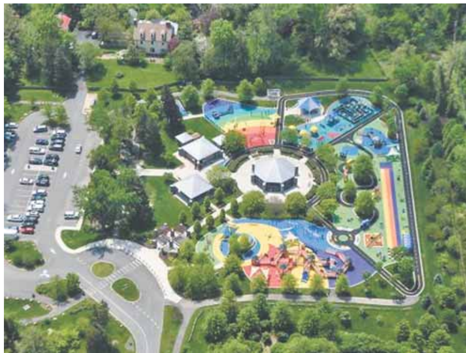
Aerial view of Clemyjontri Park with parking addition.

Runnymede Park: The Town of Herndon owns and maintains this 58-acre park. It is the site for many community nature-related events such as the annual