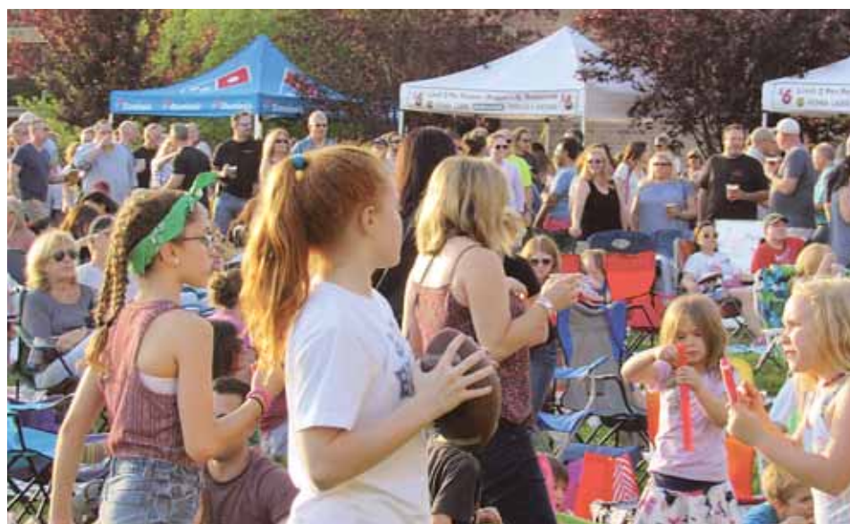
Friday Night Live! is about families, music, fun and food.

NatureFest, the Spring Native Plant Sale, and the Fall Native Plant Sale. Situated near the Sugarland Run Stream, the park attracts more than 100 species of bird, deer, fox, and other wildlife. Guided walks are offered to highlight the wildlife on the trails. Two park shelters are available for rent.