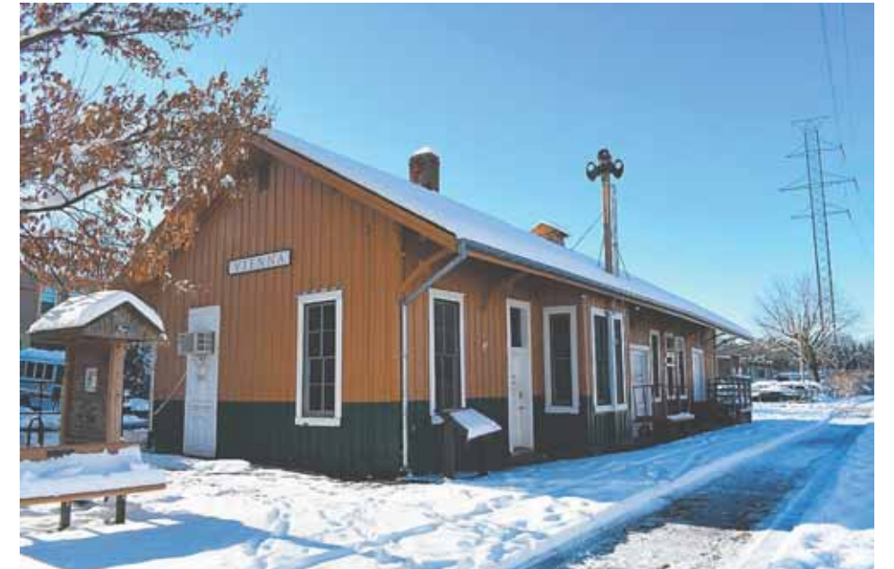
The Vienna Train Depot in the snow.