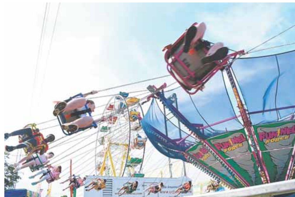
Viva! Vienna! festival is celebrated every Memorial Day weekend in the town.