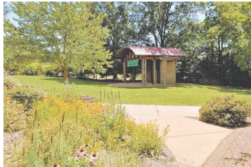
The Town Green has a small theater for local performers and events.