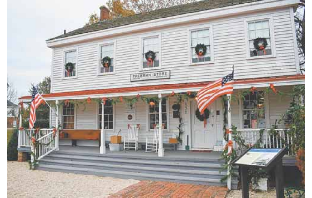
The Freeman Store and Museum decorated for the Christmas holiday.