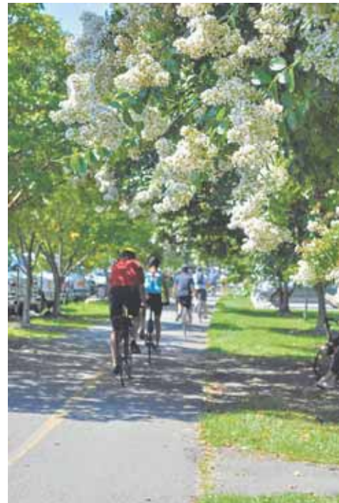
Crepe myrtle hang over the W&OD trail during the summer months.