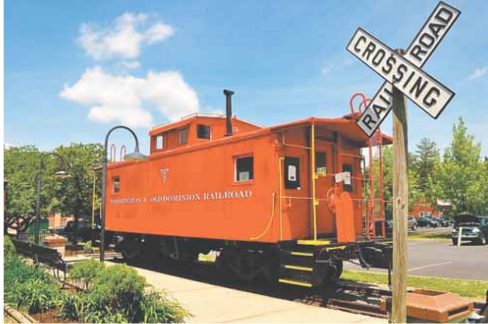
The red caboose is a bright marker for the center of town.