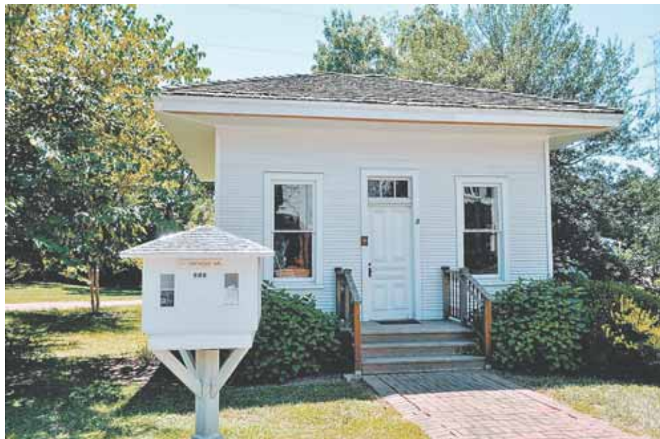
Vienna's Little Library is open the first Sunday of each month, excluding January and February, from 1-4 p.m.