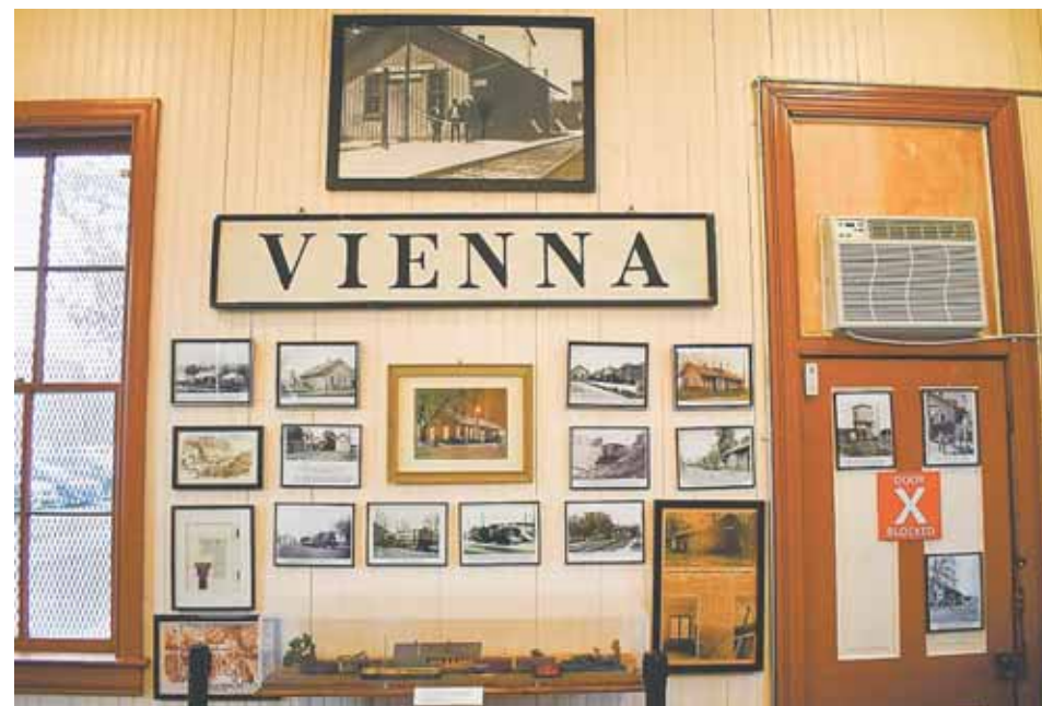
The inside of the Vienna Train Depot features old pictures of the depot.