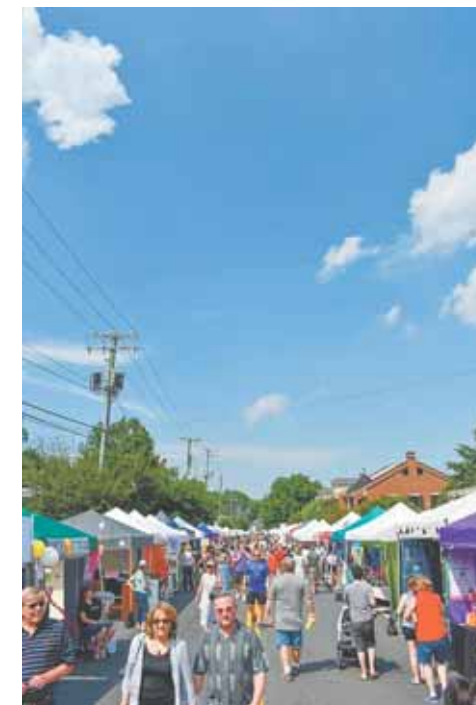
Church Street during Viva! Vienna! Vendors decorate the street.