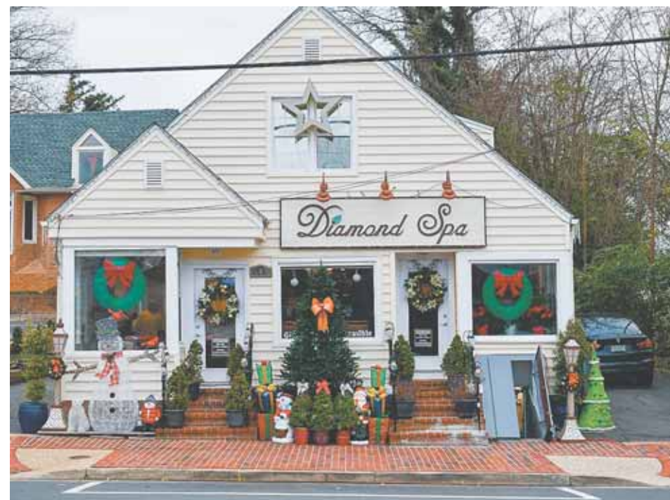
Diamond Spa sits on Church Street and offers a variety of services.