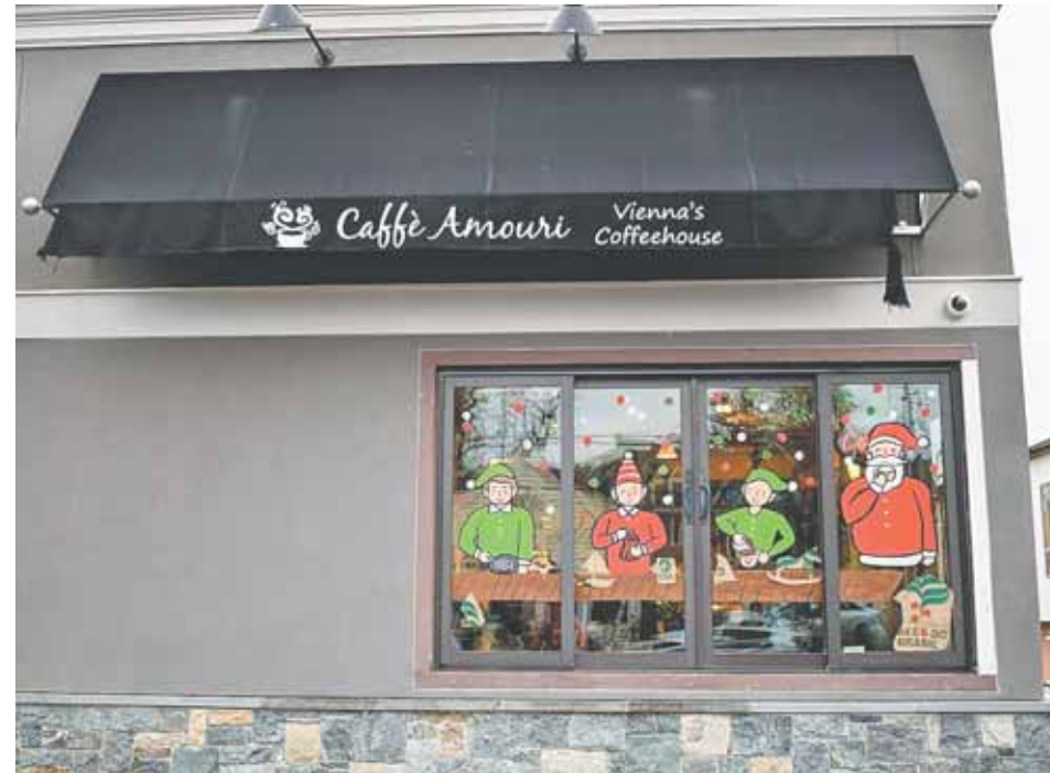
Santa and his elves enjoy a cup of coffee at Caffè Amouri.