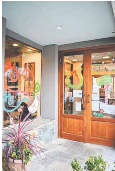
Caffè Amouri transforms into "Caffè Wonderland" during the holidays.