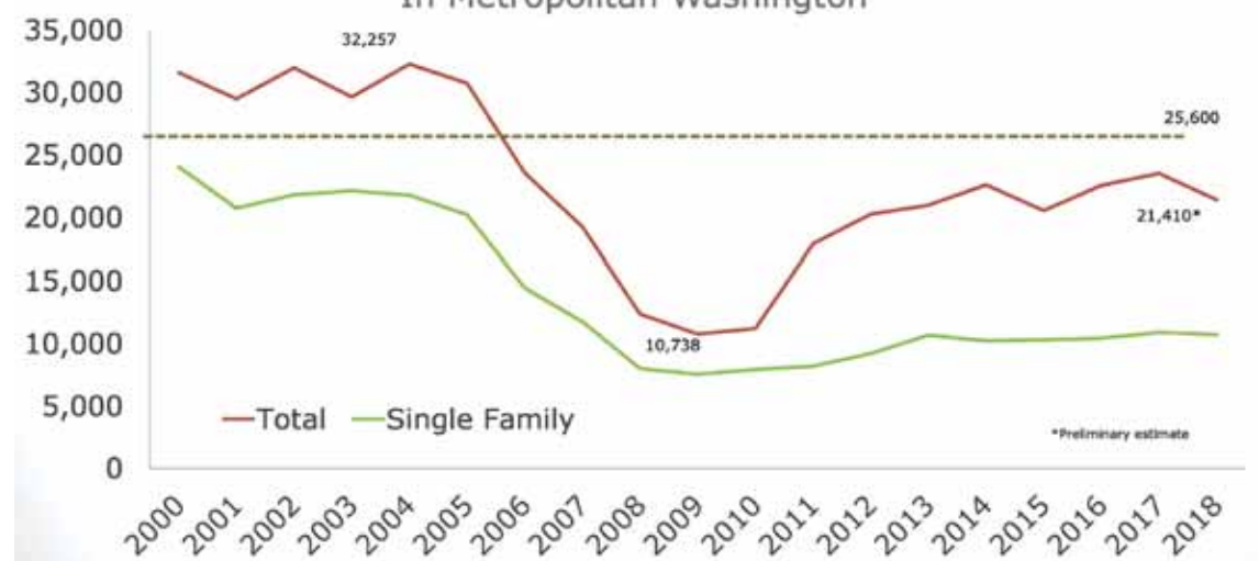
Housing Construction Permits by Year In Metropolitan Washington