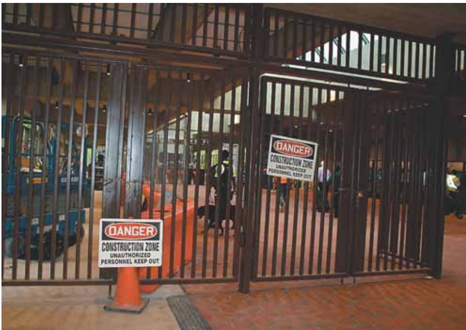
The hustle and bustle was back despite the work that is continuing at the Franconia-Springfield Metro station.