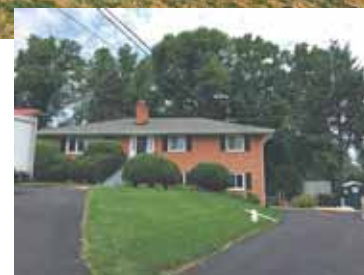
BEFORE: Situated at the top of a hill on a one third-acre lot, the Coyle’s 1,400 square foot circa 1960’s Colonial..

For Information: 703-832-8158 or 301-444-4663 or GlickmanDesignBuild.com