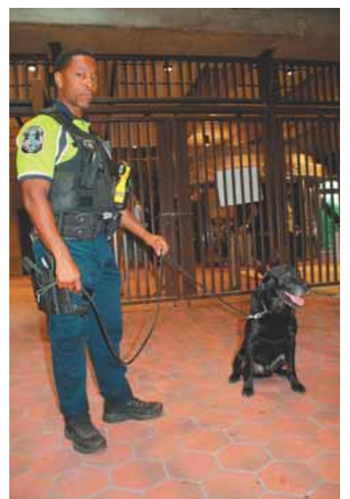
'Morgan,' the black Labrador Retriever was on hand to greet the commuters and maintain order.

Customers should listen for announcements from Metro employees or visit wmata.com for next train information, service status and trip planning.