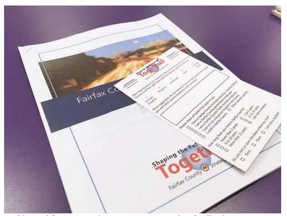
Booklet and form are an important way to gather feedback.