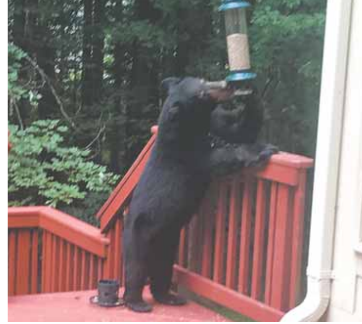
Bear on the Deck.