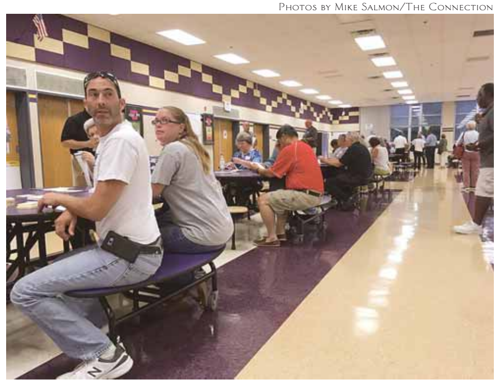
Each group focused on one of nine topics.