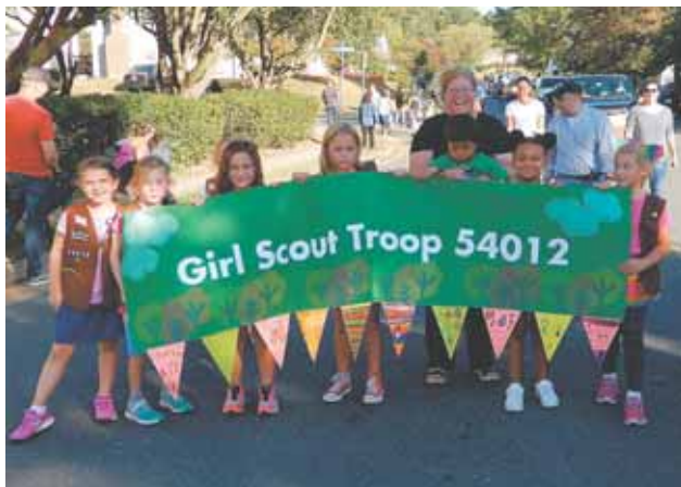
Girl Scout Troop 54012 poses for a photo.