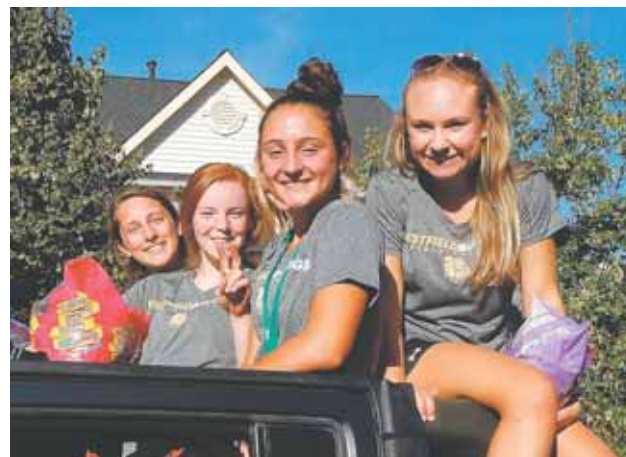
Westfield field hockey represents.