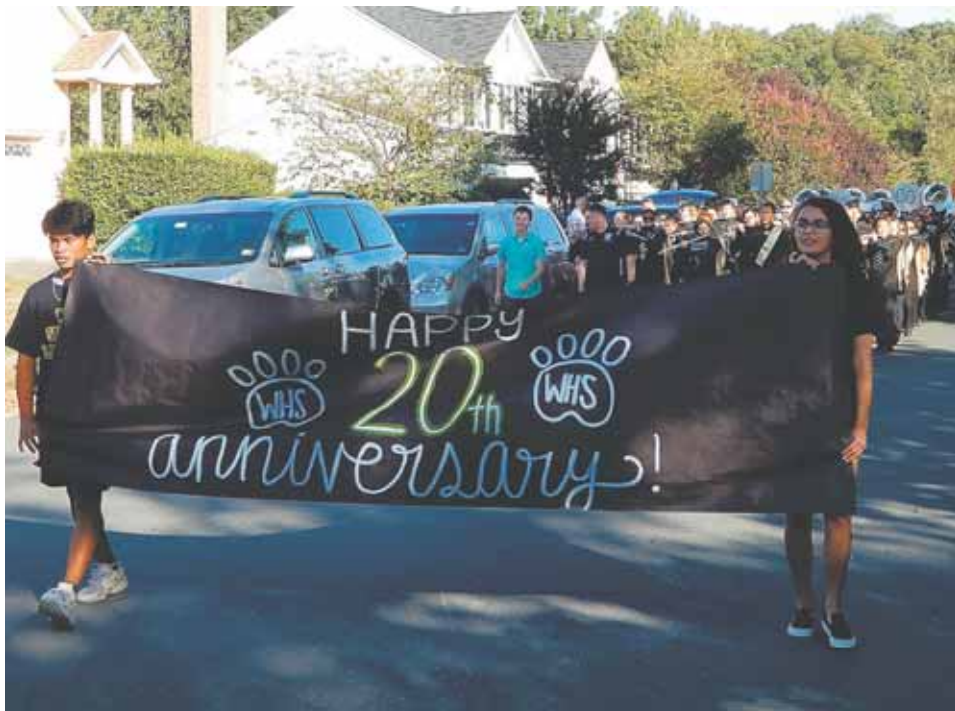
This school year is Westfield's 20 th anniversary.