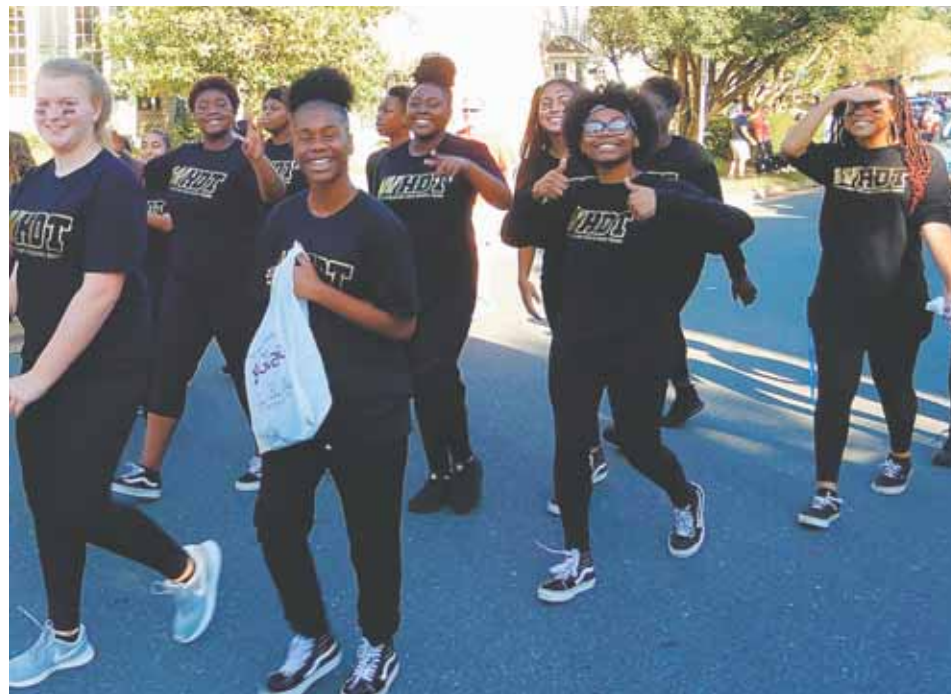
The hip-hop dance team having fun.