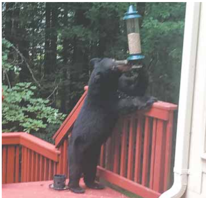
Bear on the Deck.

By e-mail: editors@connectionnewspapers.com