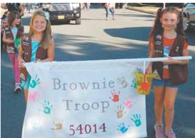
Brownie Troop 54014.