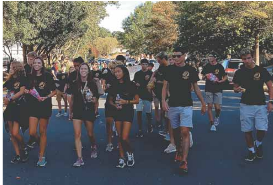
Cross-country runners walk in the parade.