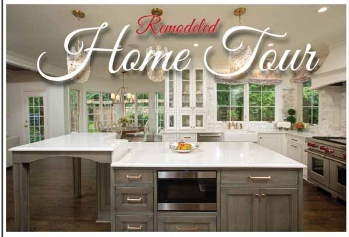
Location: 1192 Broad Creek Place, Herndon, VA 20170 (Located 1/2 mile off Route 7)

Showcasing a main-level remodel to include a gourmet kitchen, office reconfiguration, and a partial garage conversion for an enlarged laundry room and relocated powder room. Upstairs includes his & her walk-in closets, 2 hall baths, and much more!