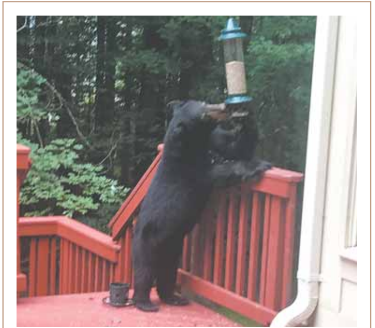
Bear on the Deck.