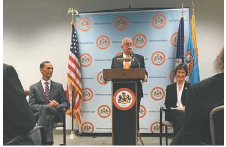
Congressman Gerry Connolly was in from his Capital Hill position to celebrate the occasion.

9/27/19 KEQUESTED IN HOMI MATERIAL TIME-SENSITIVE POSTMASTER CONNCIL SIRCULATION OTS TASAS