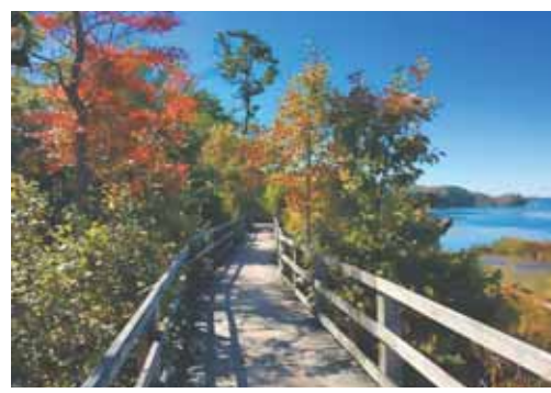
Bay view boardwalk at Mason Neck State Park

Today, visitors to southeastern Fairfax County enjoy everything from birdwatching to kayaking, strolling the Mount Vernon Estate,