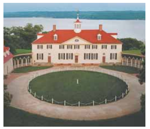
SEE TOURISM, PAGE 14 Mount Vernon Estate