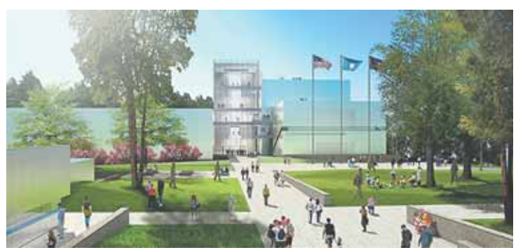
The Army Museum

"In its earliest days, Historic Route 1 and the Potomac River were the two major ways for colonial families to travel north and south in the region. Later years saw families taking Sunday drives along the parkway to venture