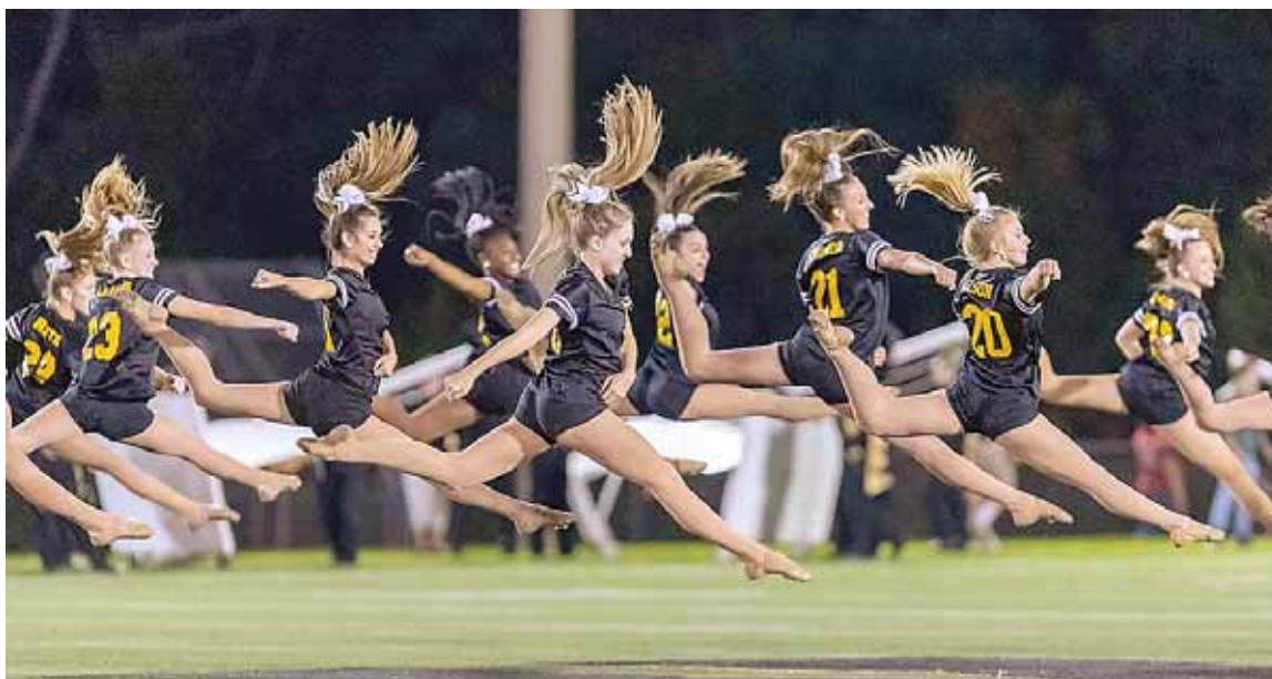
The dance team shows Westfield school spirit.