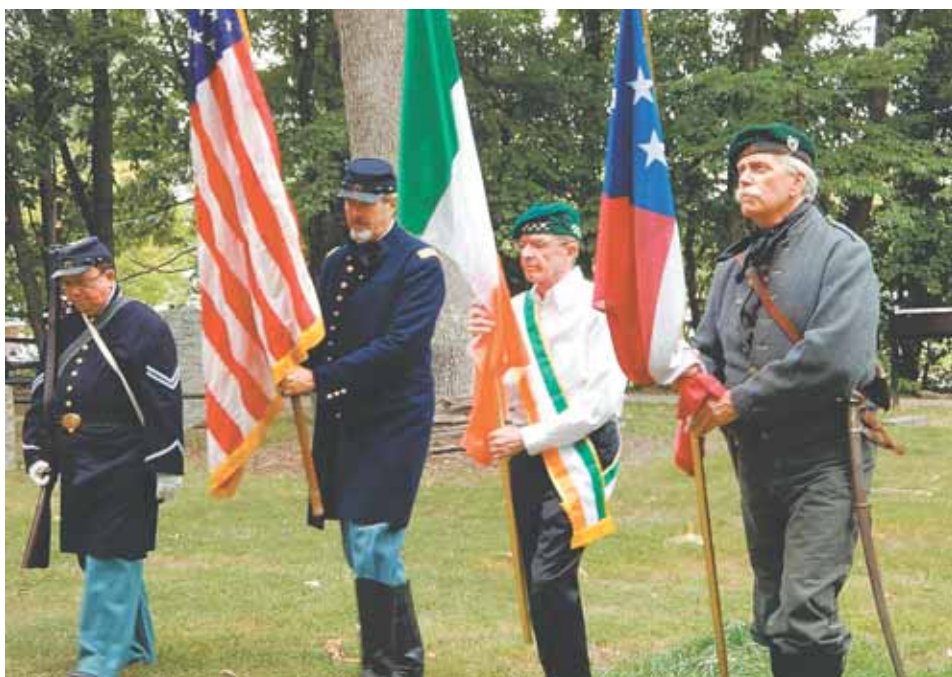
The Ancient Order of Hibernians Color Guard.