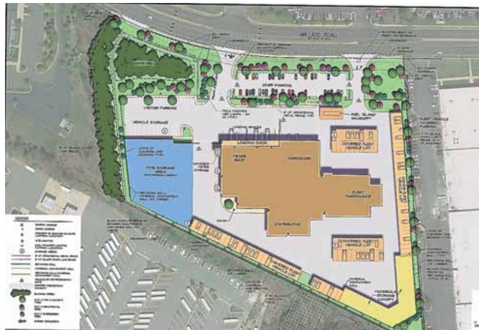
A detailed look at the water facility's site plan.