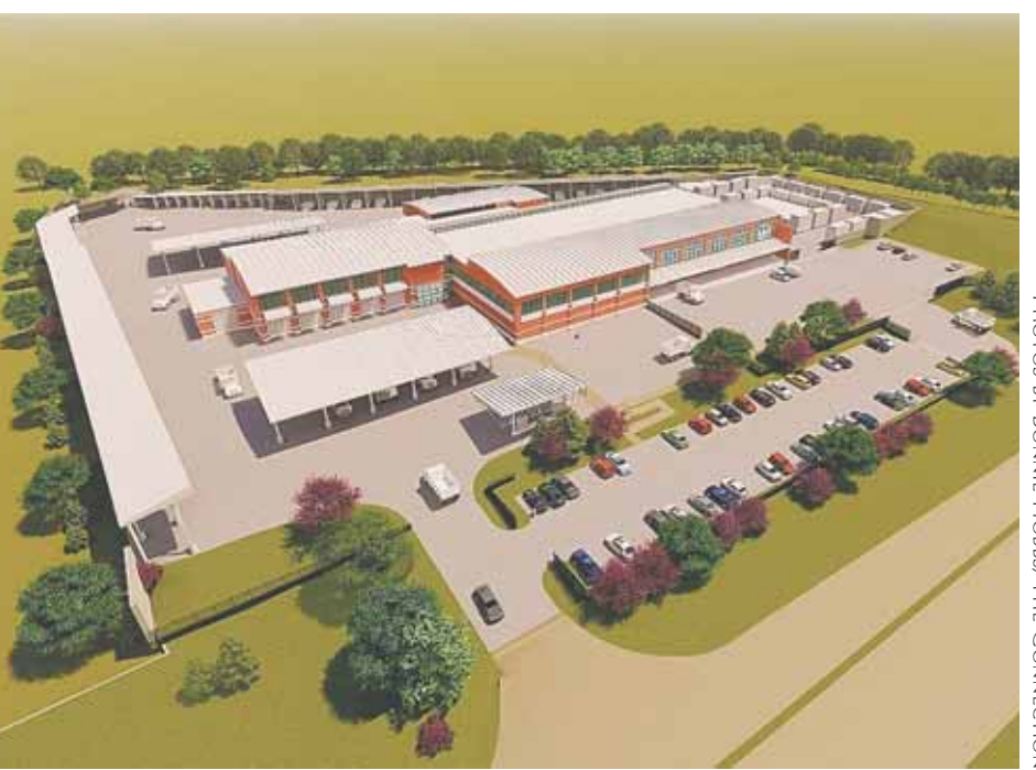
The site layout of the new water-maintenance facility in Chantilly.