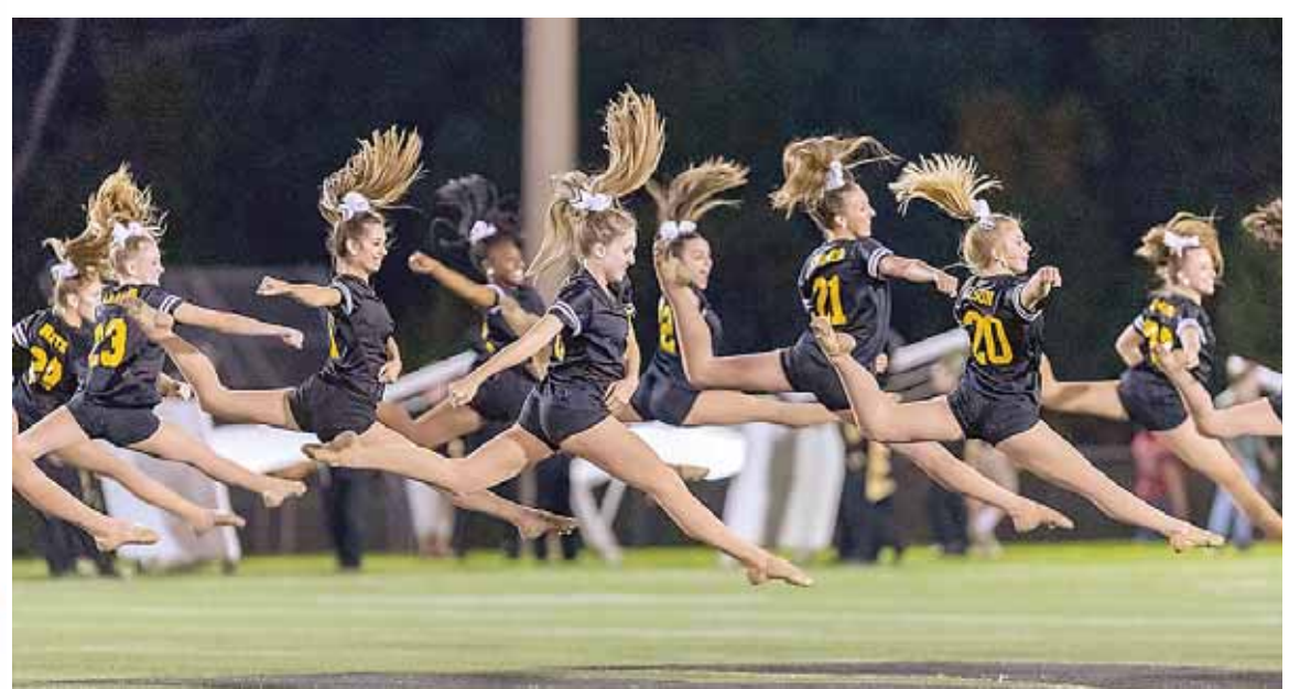
The dance team shows Westfield school spirit.