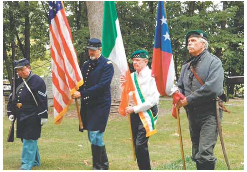
The Ancient Order of Hibernians Color Guard.