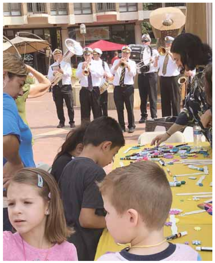
Children create art as the New Line Brass band goes New Orleans-style with a processional around the festival grounds following the Welcome Ceremony and Naturalization Ceremony during the 2019 Reston Multicultural Festival.

G ♣ Reston Connection ♣ October 2-8, 2019