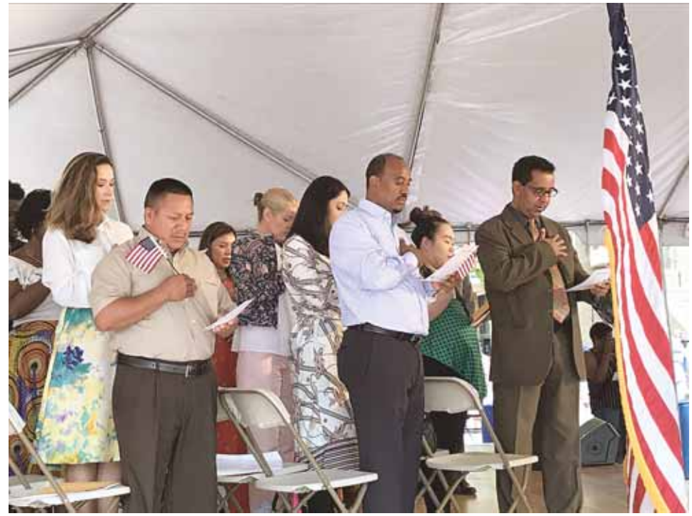
Following the Oath of Allegiance, new citizens recite the Pledge of Allegiance.