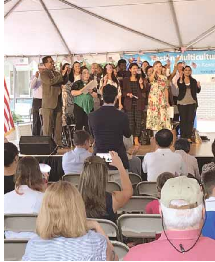
New citizens wave their flags, the Stars and Stripes at the Naturalization Ceremony held at the 2019 Reston Multicultural Festival.