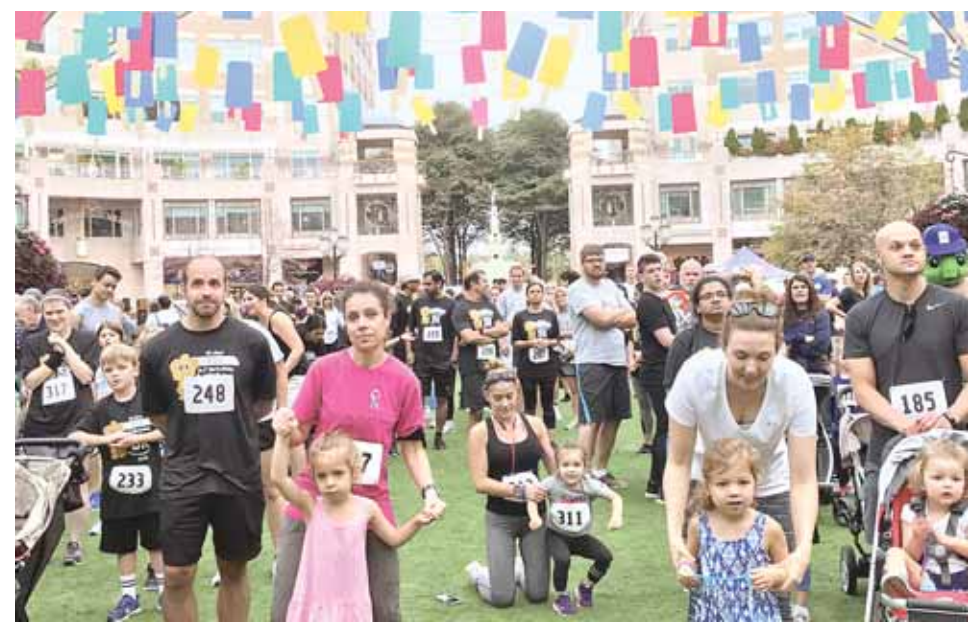
Parents help their children during warm-ups before the start of the 5th annual 5K & Family Health Fair: Race To Make It All Better at Reston Town Center to benefit the nonprofit medical group practice, Pediatric Specialists of Virginia (PSV) located in Fairfax.