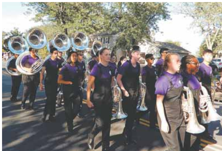
Band members march down Majestic Lane.