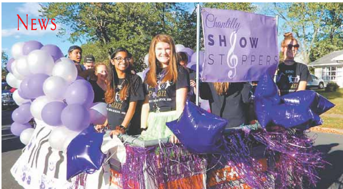
Chantilly Show Stoppers show their spirit.