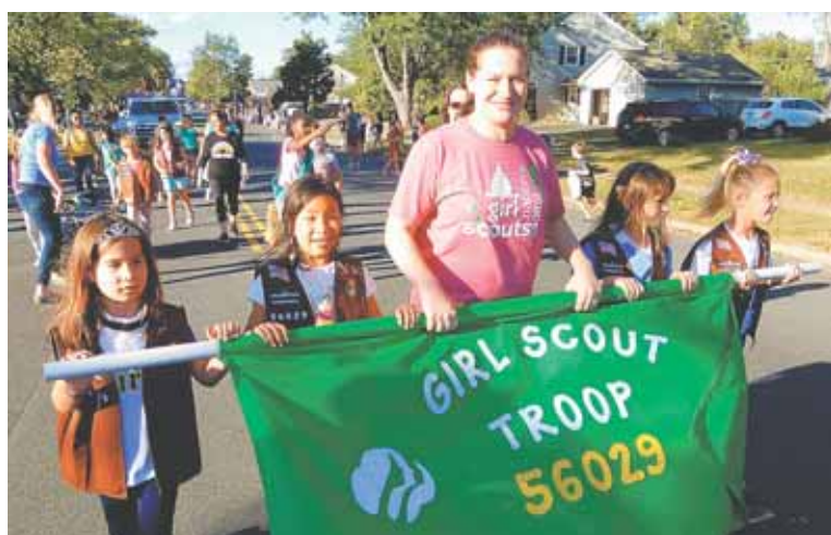
Girls Scout Troop 56029 on parade.