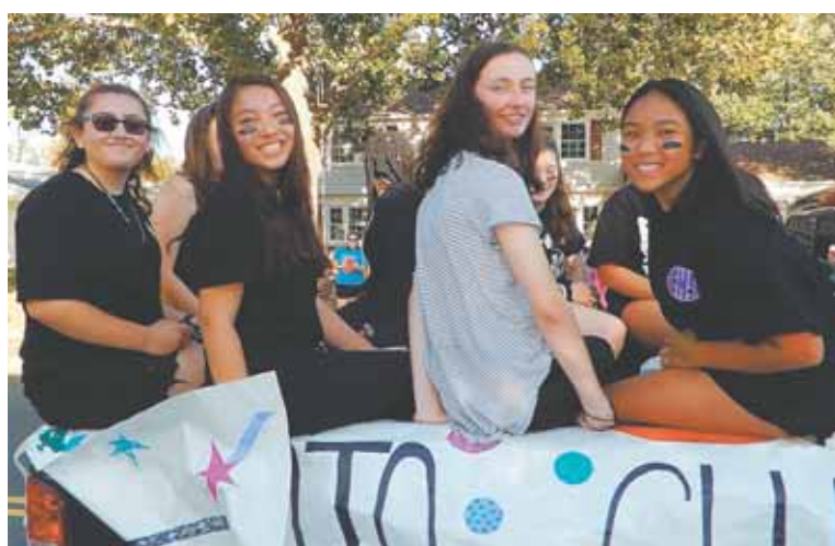
Some members of the school's Photo Club.