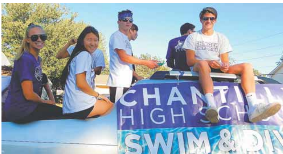
The swim and dive team rides atop a truck.