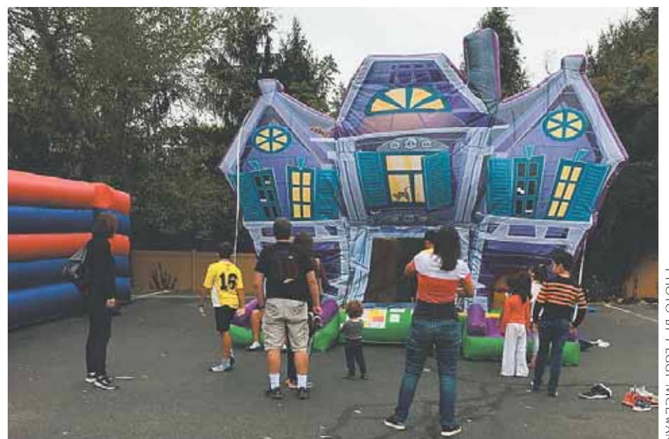
Perfect for the season an inflatable haunted house invited brave visitors.