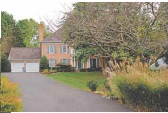
6 8509 Potomac School Terrace — $1,156,000