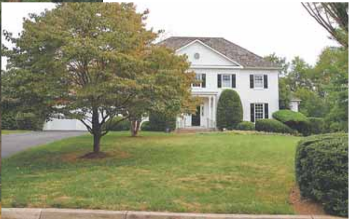
3 9325 Crimson Leaf Terrace — $1,250,000