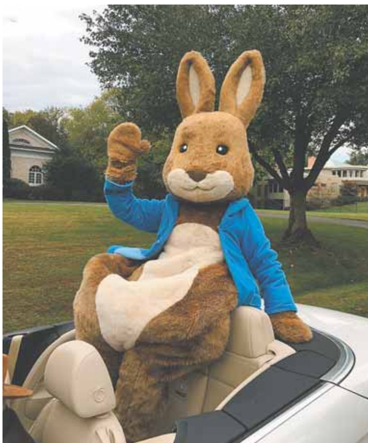
Peter Rabbit, sponsored by Friends of the Library Potomac, waves to parade goers.