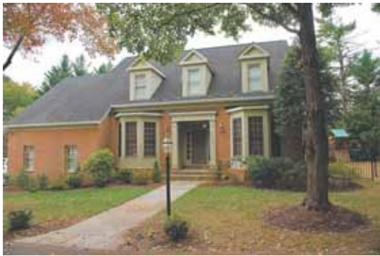
7 10401 Democracy Lane — $1,150,000