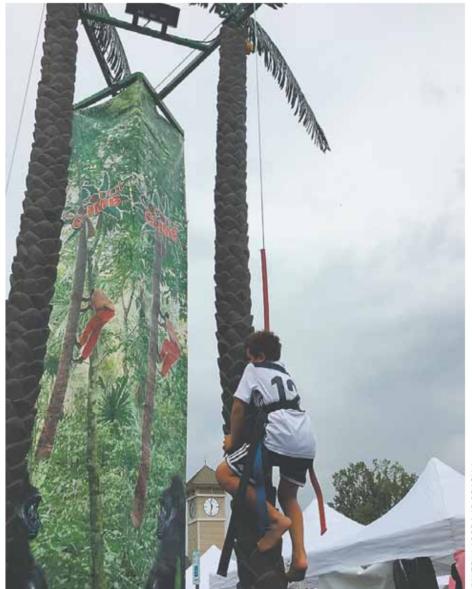
Potomac Day visitors had the chance to climb a palm tree.