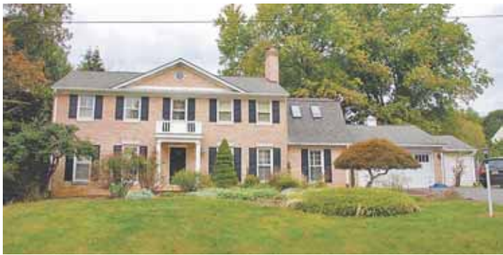
8 9017 Marseille Drive — $1,040,000