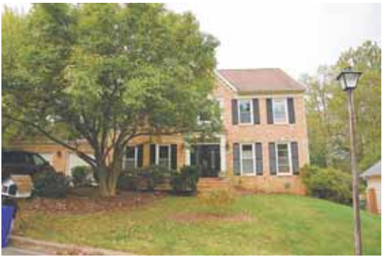
9 9024 Mistwood Drive — $1,000,000

IN AUGUST 2019, 65 POTOMAC HOMES SOLD BETWEEN $3,300,000-$310,000.