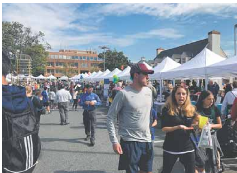
Tents for the business fair with almost 100 represented.