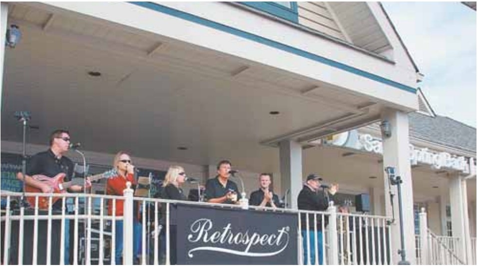
The Band, Retrospect