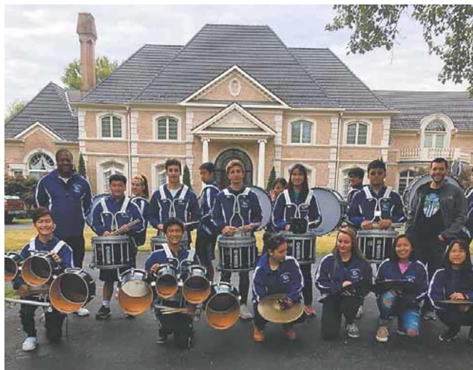
Members of Winston Churchill High School Drumline wait for the Potomac Day parade to begin