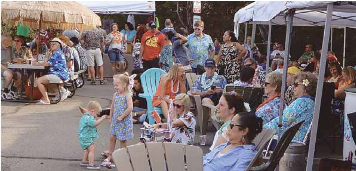
People of all ages enjoyed the Hawaiian-themed, anniversary celebration.