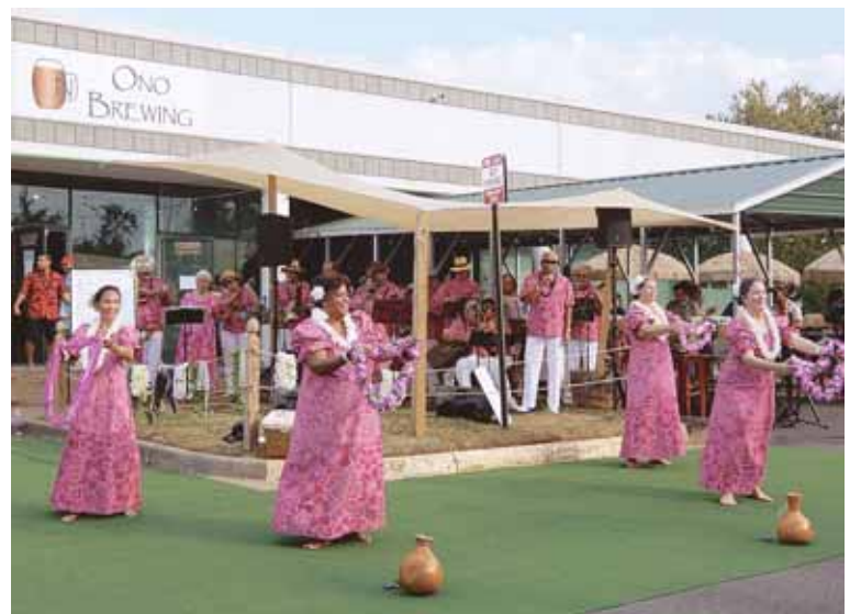
Dancing the hula are members of HSS Ukulele Hui.