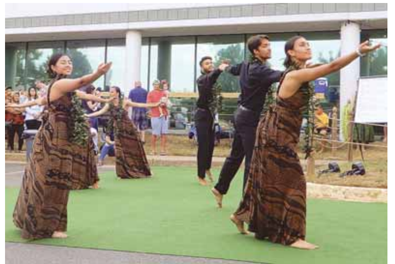
Alakáí dance instructors from the E Ala E Hawaiian Cultural Center perform.