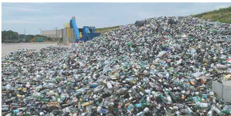
Growing glass pile.