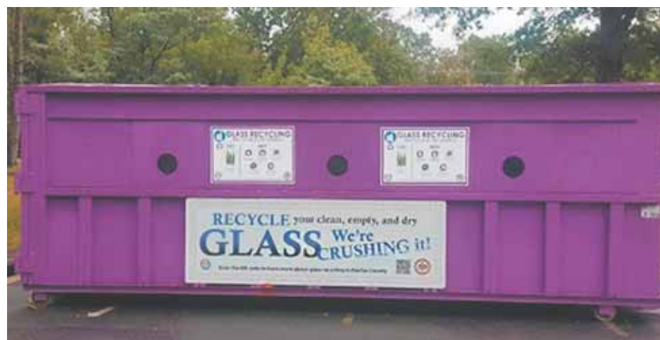
Lawyers Road-Reston Parkway Park-And-Ride location