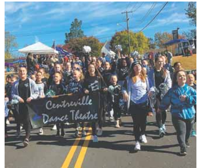
Centreville Dance Theatre marching in the parade.