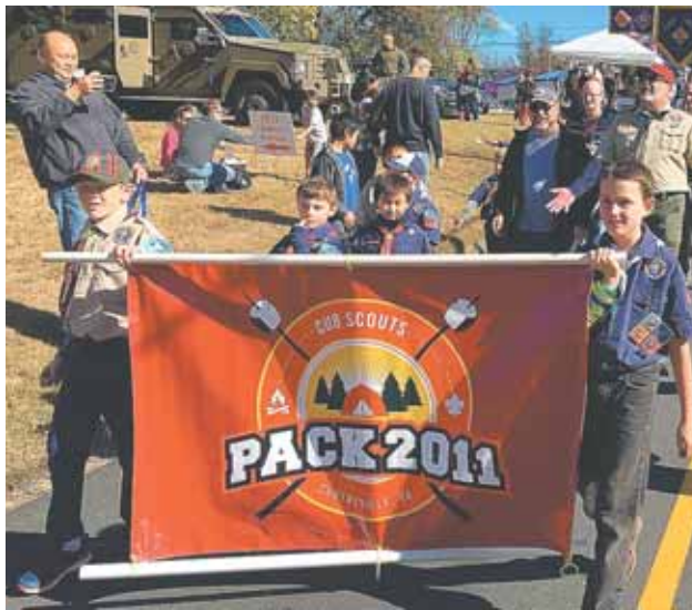
Cub Scout Pack 2011