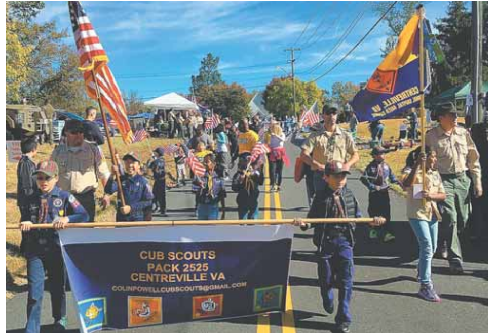
Cub Scout Pack 2525