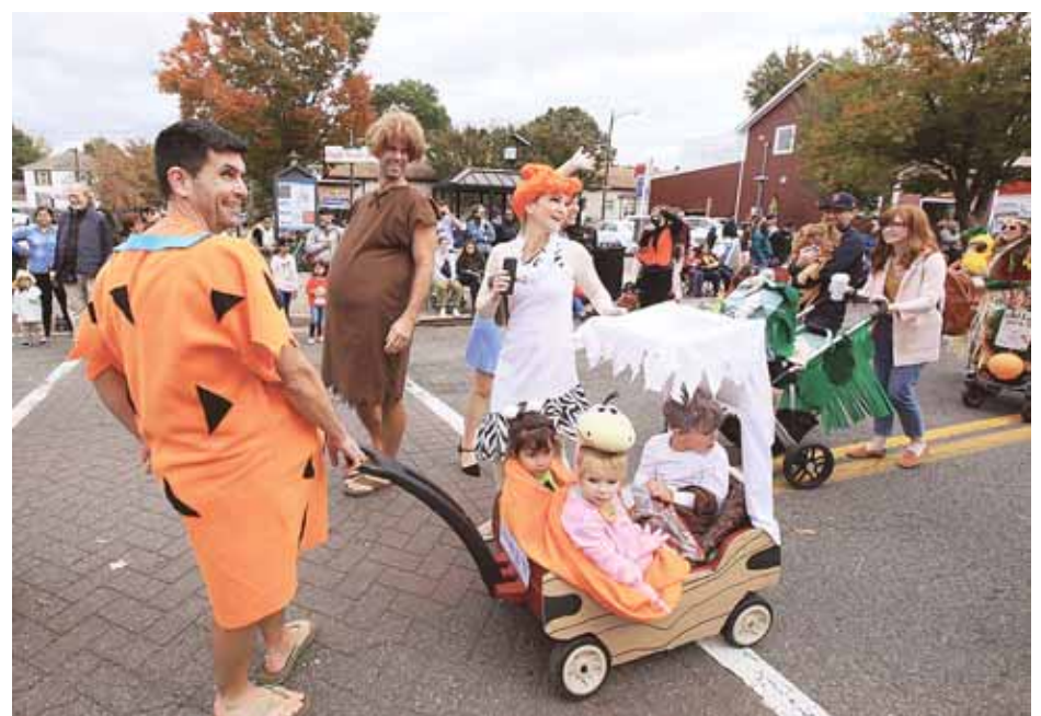
The Flintstones join in the 2018 Del Ray Halloween Parade.

At 915 King Street, Old Town Alexandria. Ten Thousand Villages, Alexandria's first fair trade retailer, will have its 25th anniversary party. The store has been operating on King Street in Old Town since 1994. The store opened in October 1994 at the corner of King and Alfred Streets, where it remained for 11 years. It moved across the street in 2005. At the celebration, there will be international cuisine,