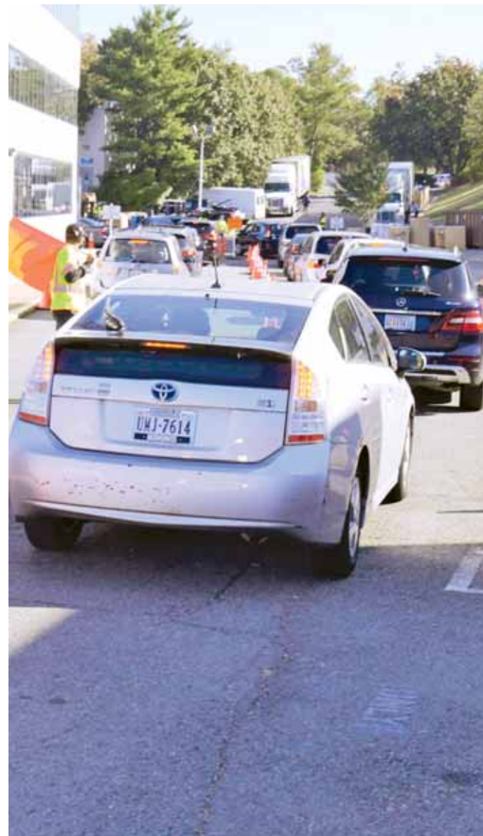
Cars wait in line for blocks to donate hazardous materials and bikes at the semi-annual E-CARE event on Saturday, Oct. 19.