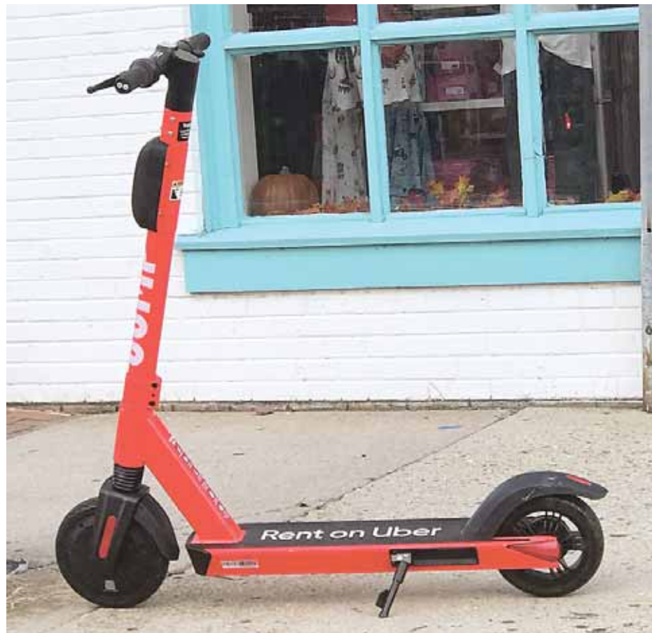
Uber Scooter, this one in Alexandria.

A permit process should be established, staff proposed, to hold operators to performance standards, including equity expectations "to ensure that access to these services is made as broad as possible." The proposed permit process expects that at least 15 percent of permit-holders' devices in service be deployed each morning in locations outside the Rosslyn-Ballston and