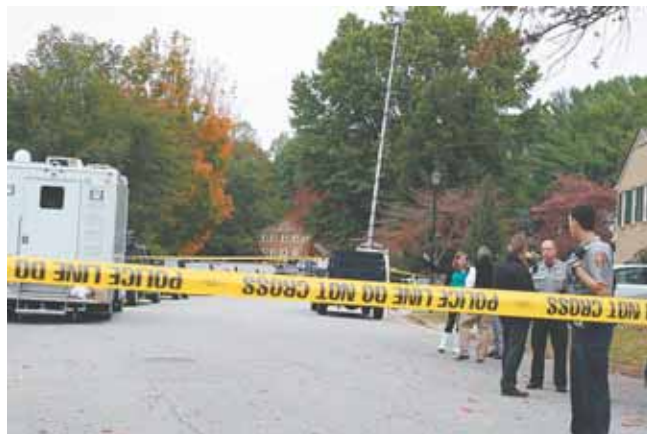
Police remained on the scene the next day, conducting the investigation.