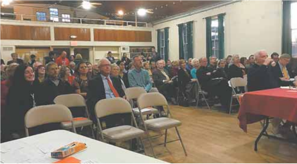
Great Falls Citizens Association Candidates Forum was held Oct. 16 at the Grange.