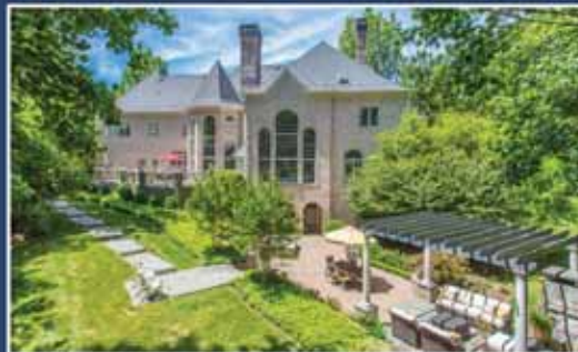
Great Falls $3,699,000