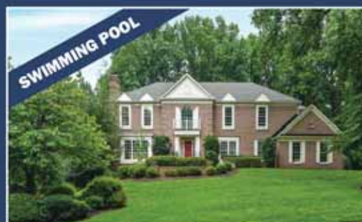
Great Falls $1,399,000