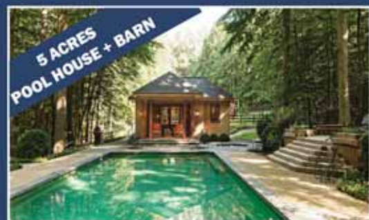
Great Falls $1,995,000