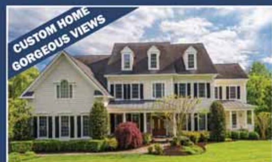
Great Falls $1,700,000