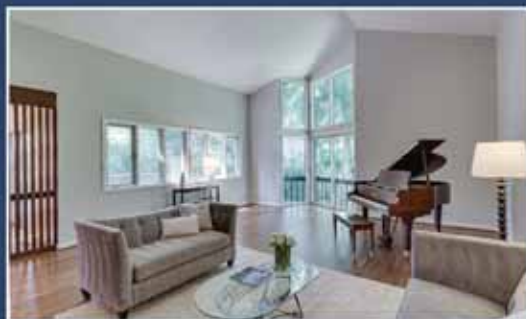
Great Falls $990,000