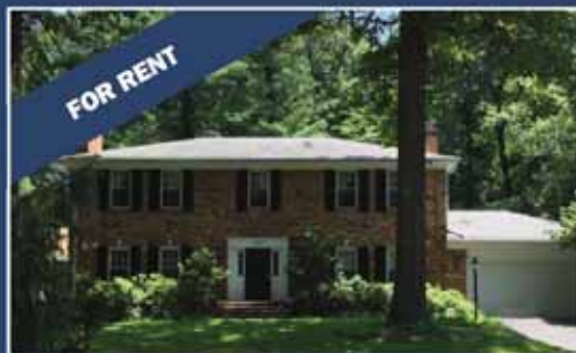
Great Falls $3,950