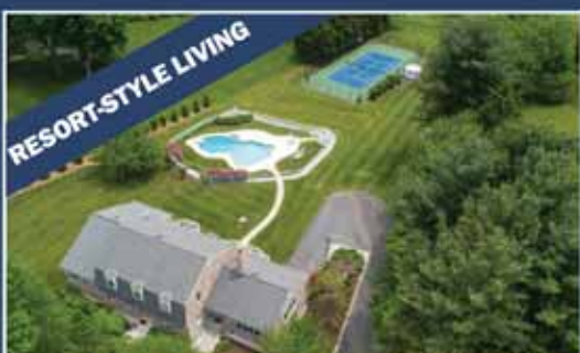
Great Falls $1,150,000