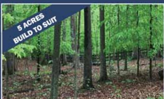
Great Falls $1,199,000