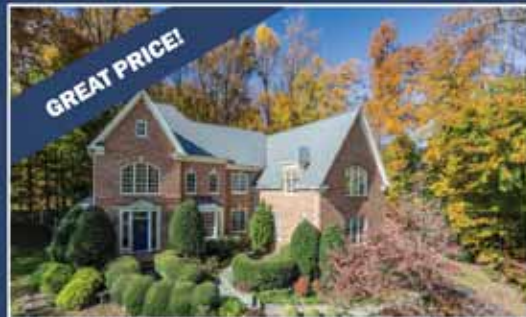
Great Falls $1,299,000

If you're buying or selling a home, think of this as a defining moment.