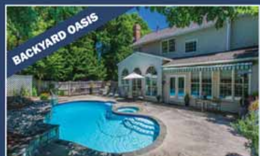
Great Falls $1,249,000