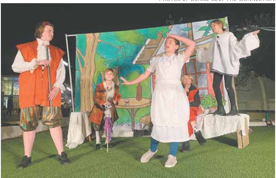
The Traveling Players Ensemble performs on The Plaza at Tysons Corner Center.