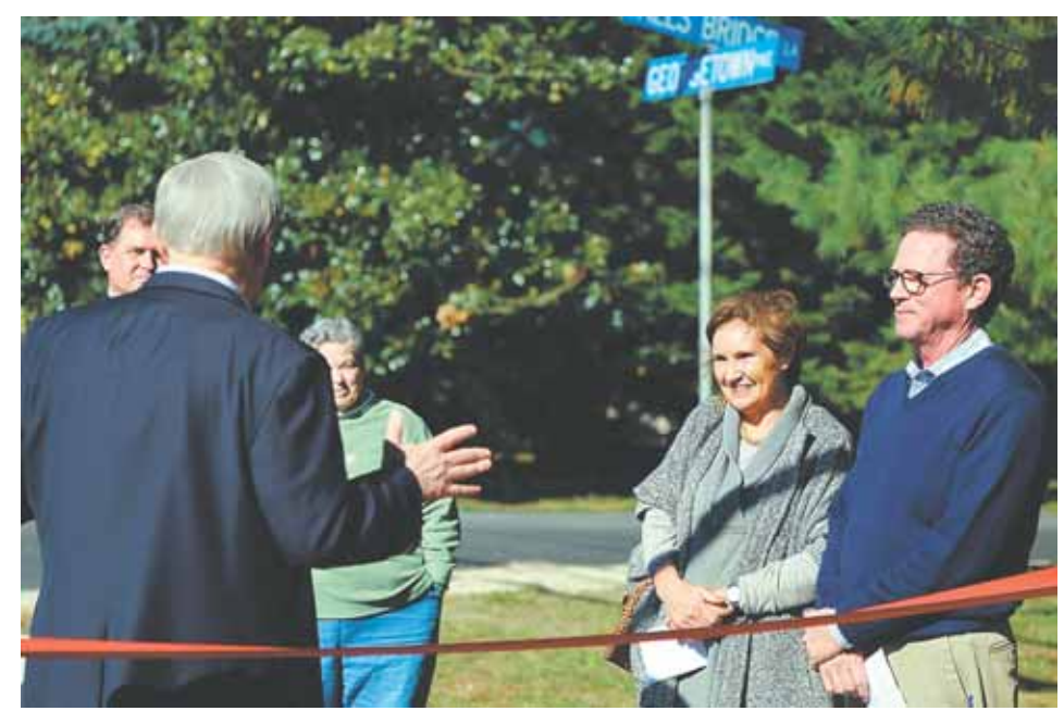
THE CONNECTION T Falls Trail Rlazers says it is very