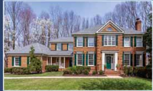
Great Falls $1,150,000