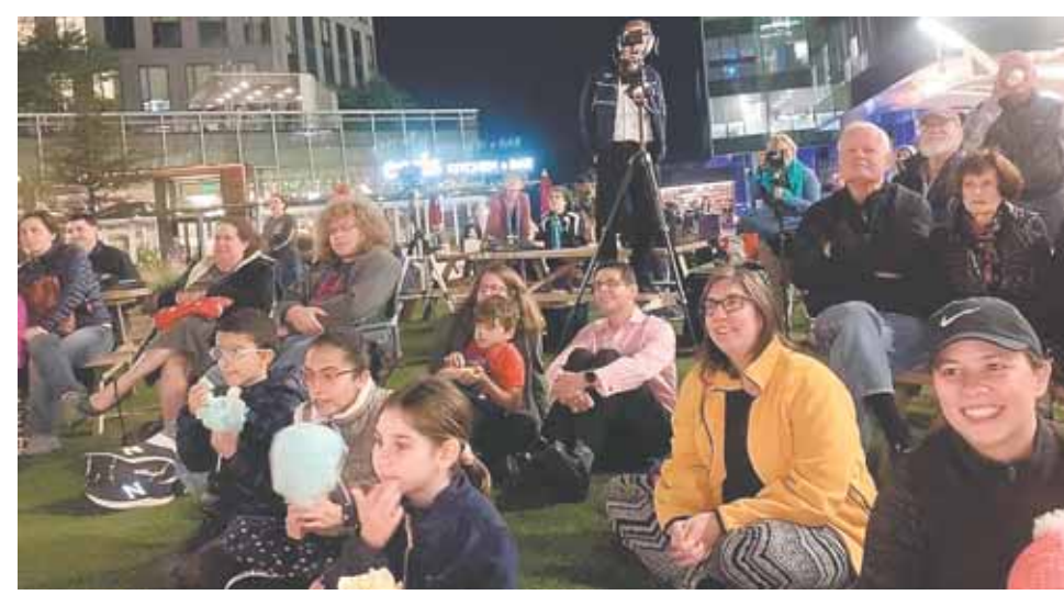
A large crowd gathered to watch the Traveling Players Ensemble perform on The Plaza at Tysons Corner Center.