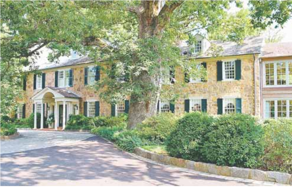
Colonial Revival Stone Manor House at Ballantrae Farm Estate.