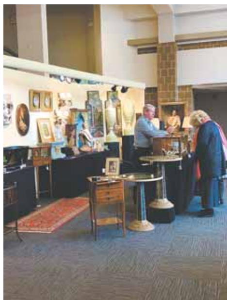
Visitors wander the McLean Community Center in search of something one-of-a-kind for their homes.