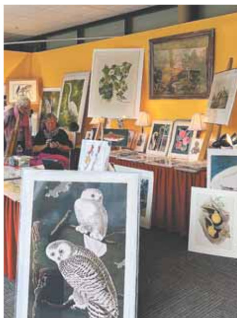
A vendor makes the sale to a customer, happy to be taking home an antique print.