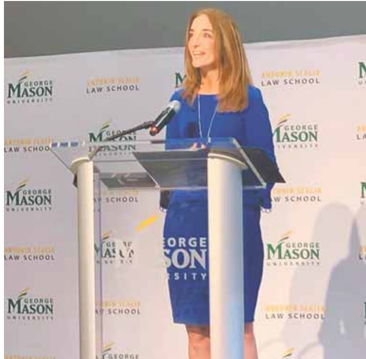
Speaker-designee, Del. Eileen Filler-Corn (D-41) is the first woman to ever serve as Speaker of the House of Delegates in the 400 years of its history.

The new members of the legislature have already indicated their willingness to make history. The Democratic caucus of the House met this past weekend and chose as its Speaker-designee, Delegate Eileen Filler-Corn, the first woman to ever serve as Speaker of the House of Delegates in the 400 years of its history. She will be elected formally by the entire House when the General Assembly convenes in January. Adding