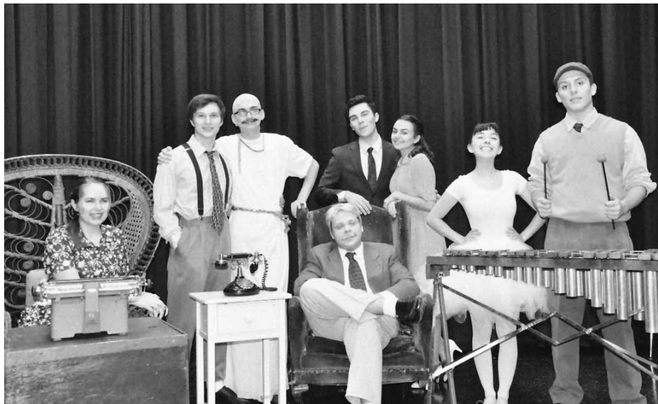
The cast of McLean High School's production of "You Can't Take It With You."