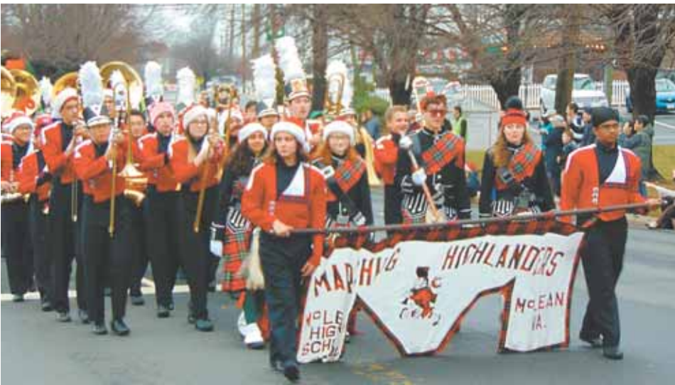
The McLean High School Highlanders Marching Band marches in 2018 parade; the 2019 Winterfest Parade will be Dec. 1.