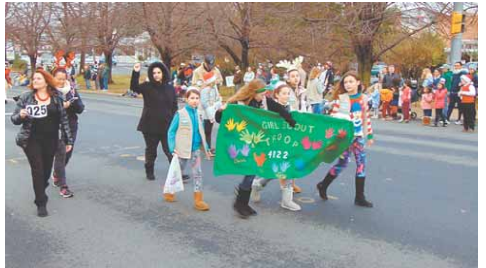
The Girl Scout Troop 4022 marches in the 2018 parade; the 2019 Winterfest Parade will be Dec. 1.