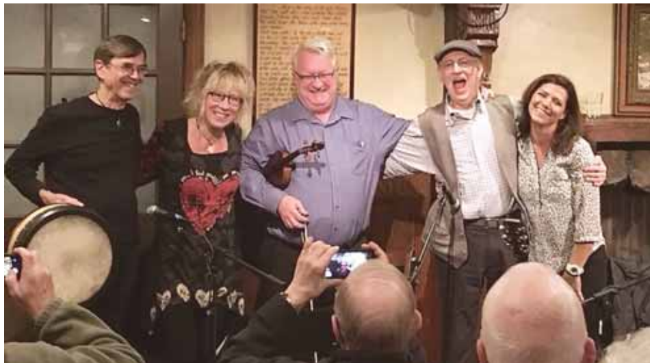
The Irish Inn Mates will play at The Old Brogue Irish Pub in Great Falls on Sunday, Nov. 17 at 5 and 7 p.m.

Tickets are $12 online, $15 at the door, and $8 for students, and can be purchased at https://www.etix.com/ticket/v/15599 .