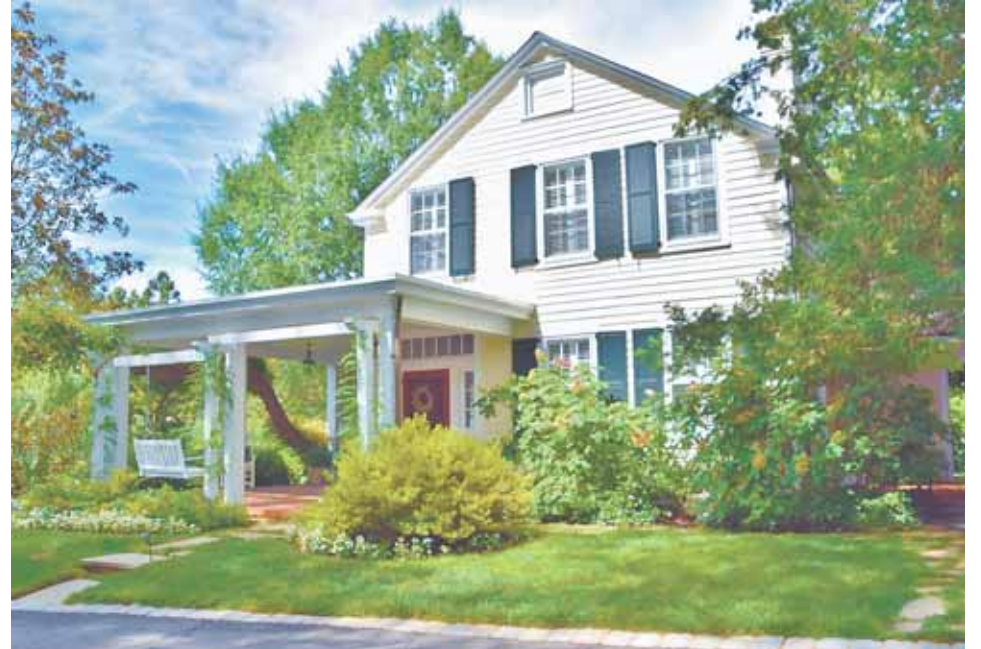
"Little Ballantrae", the original farmhouse at Ballantrae Farm Estate.