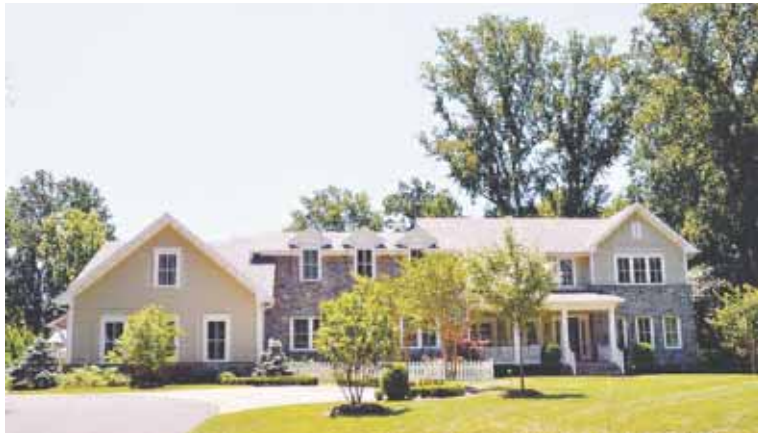
“Modern” House on Benjamin Street, Langley Forest.

ted, but dining and living areas are well-defined by shape and furnishings. The house area is 8,500 square feet, and the roomy basement contains a recreation room and a mini-soccer court. Behind the home are large patios, a swimming pool, a garden house, and a dining cabana. A three-car garage is attached to the home. The house is unusual in being equipped for geothermal heating.