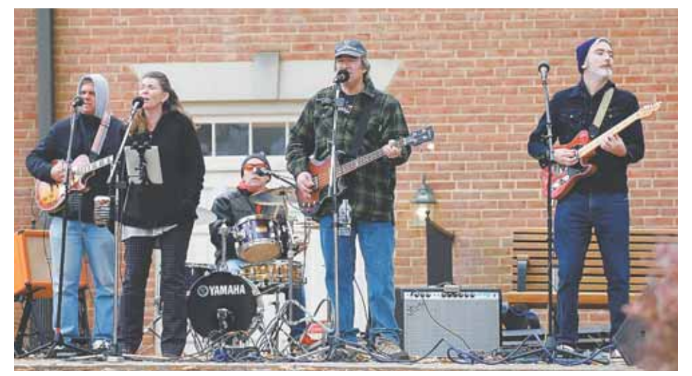
Delaney Hall Band greets the walkers at the after-party.