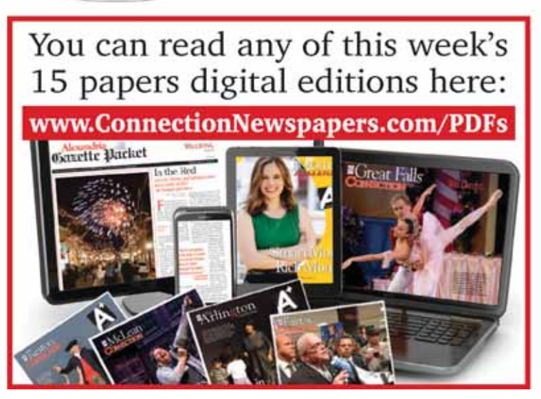
14 * Fairfax Connection * November 28 - December 4, 2019