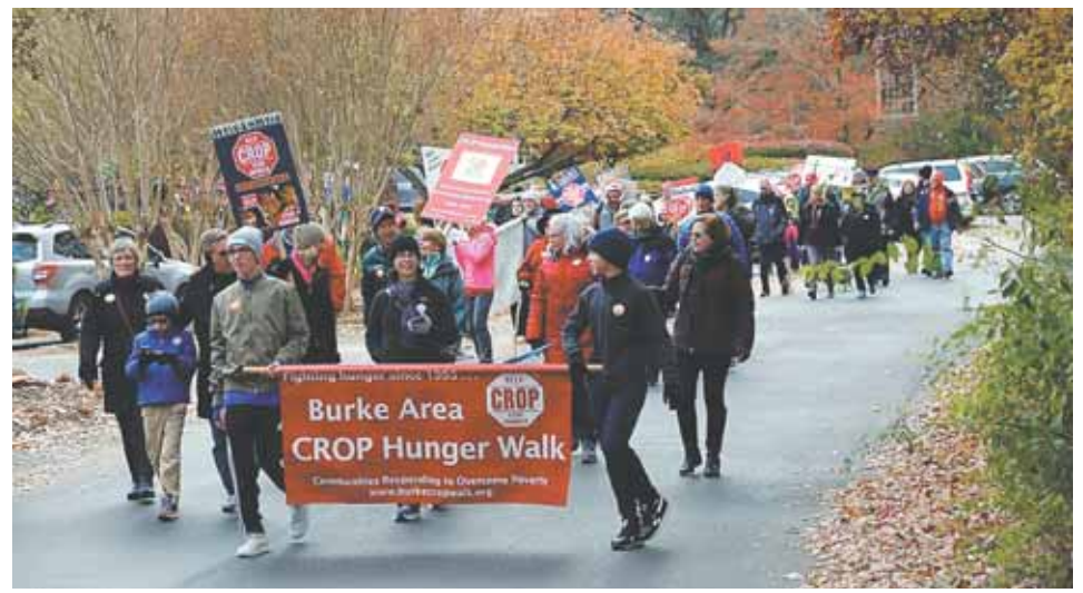
The line of walkers wound around through the streets of Fairfax.