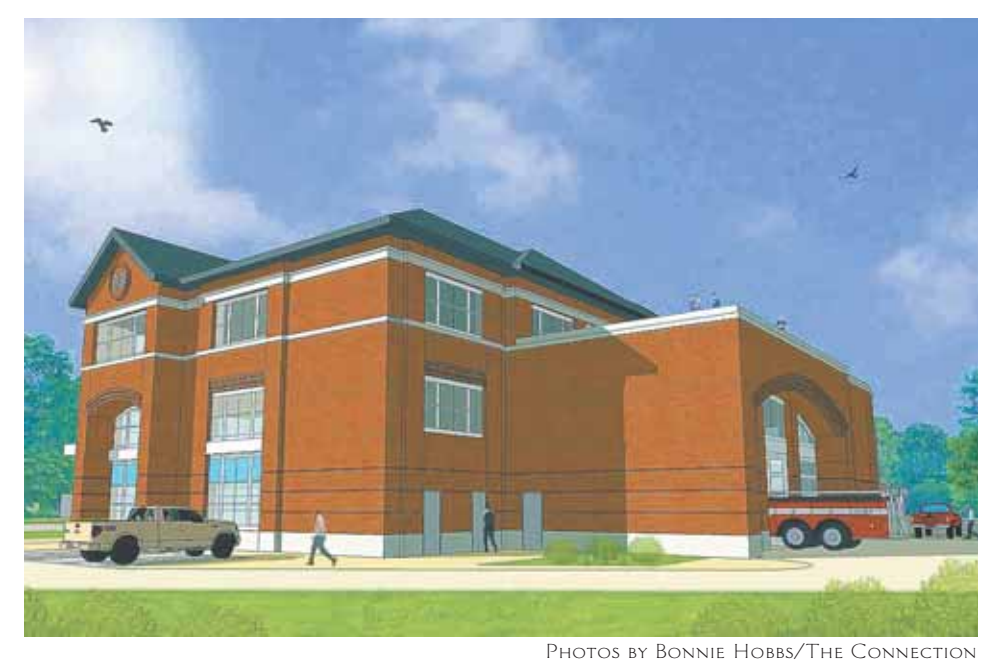
Artist's rendition of the new, state-of-the-art Fire Station 33.