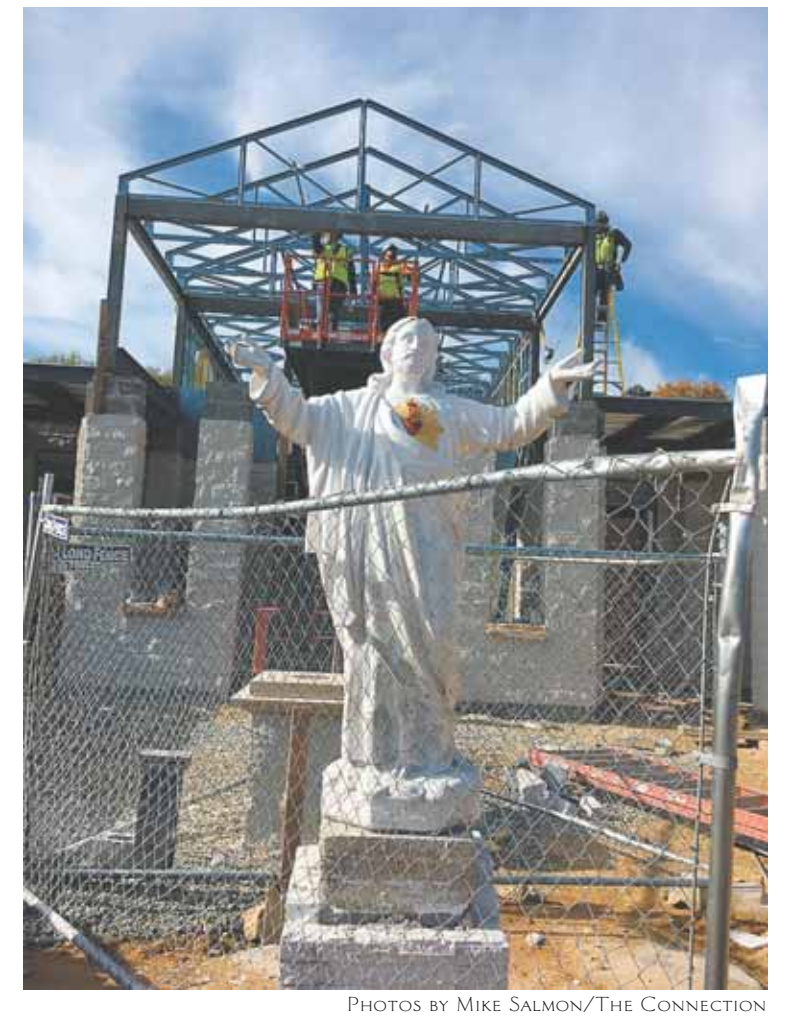
A statue gives the site a blessing.

The church was built in 1970 and the interior was upgraded in the 1990s. While it was under construction, the original parish met at Edison High School to celebrate mass until the church facility was completed.