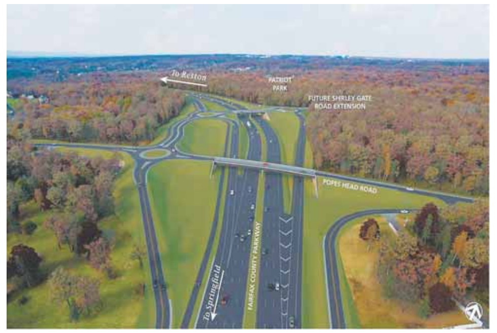
At Popes Head Road, eliminating the traffic signal will improve the traffic flow through here.

The project will also include improving the Route 123 interchange, the Fairfax County Parkway/Burke Centre Parkway intersection, and a section of a shared-use path. This is a missing segment on the shared-use path between Burke Centre Parkway to Route 123.