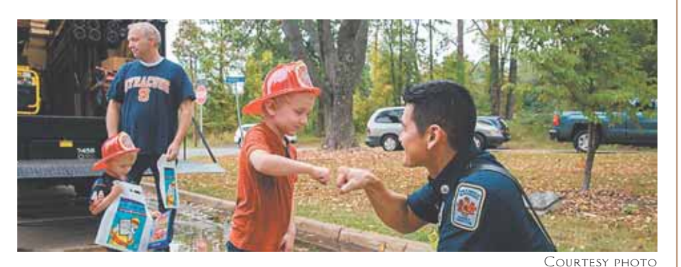
Fairfax County Fire and Rescue Stations will accept donations through Friday, Dec. 13.