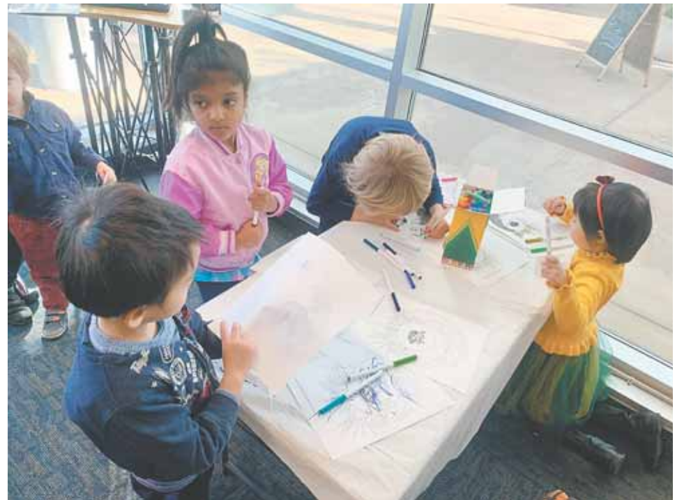
Children participate in coloring activities at the celebration.