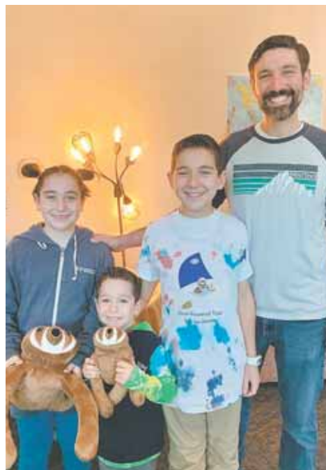
The Hutchins family from Centreville volunteer at the celebration.

River-Sea Chocolates partners with small-scale growers that practice sustainability to source fine cacao beans. In April of 2019, the company spearheaded efforts to sail the first wind-powered sail cargo ship in America, one of only four operating sail cargo ships in the world, to import a ton of