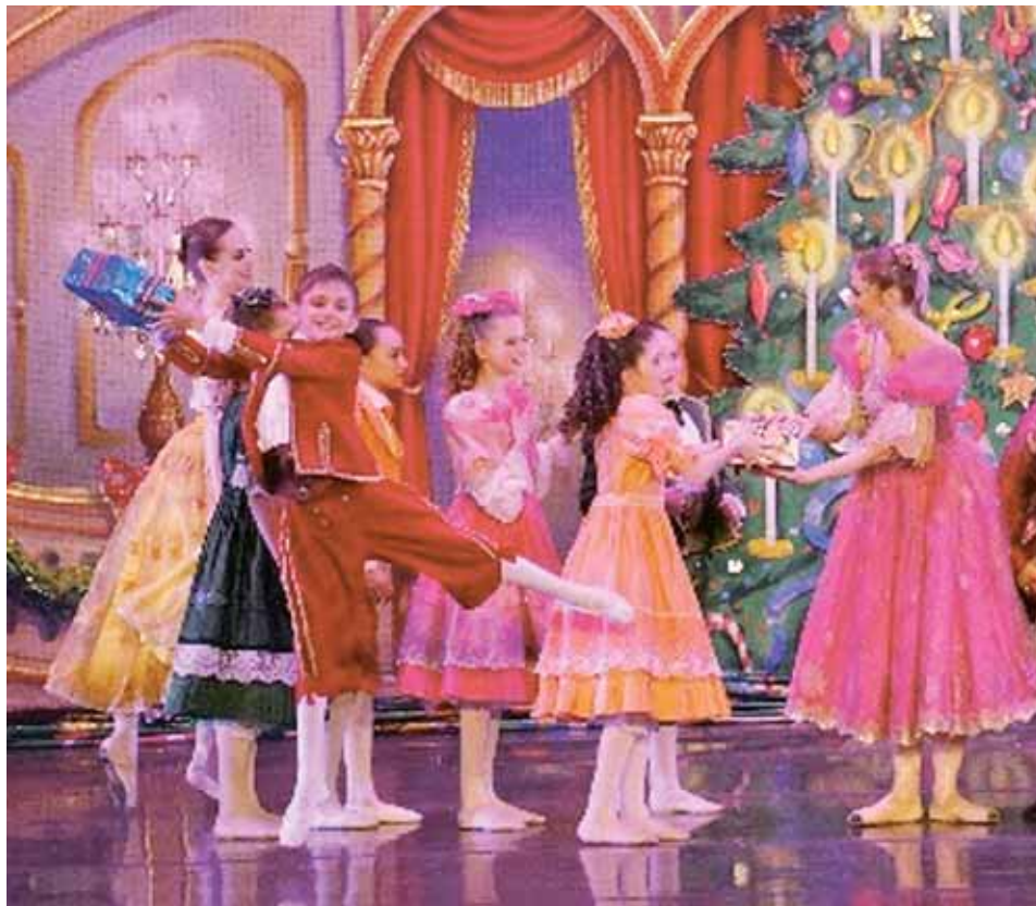
The Moscow Ballet will present "The Nutcracker" on Dec. 10-11 at GMU's Concert Hall.