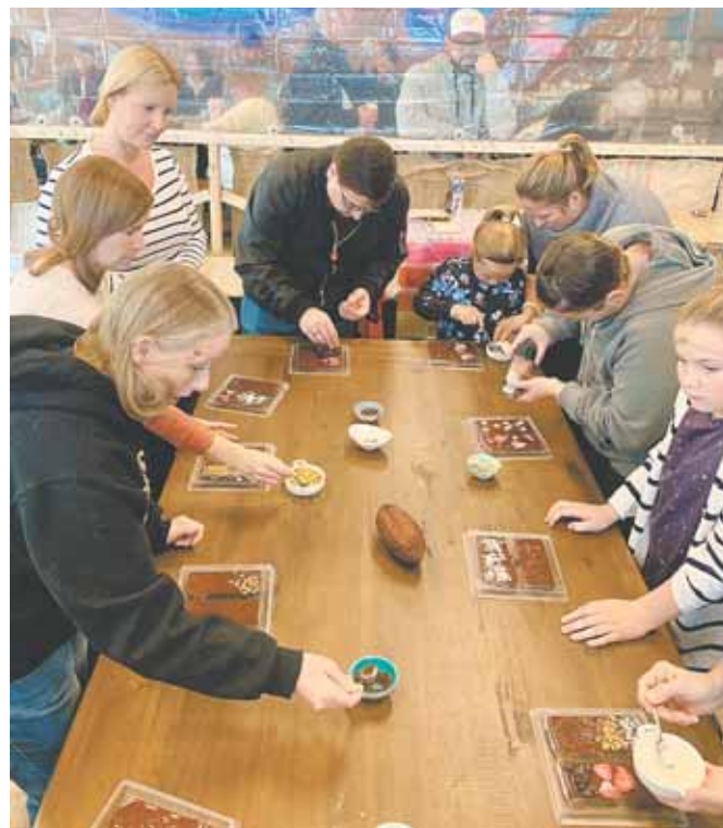
Participants add toppings to make their own chocolate bars.