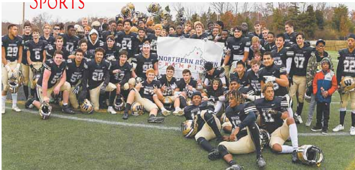
Westfield Bulldogs, Northern Region Champs, after defeating Yorktown Patriots 35 - 7.