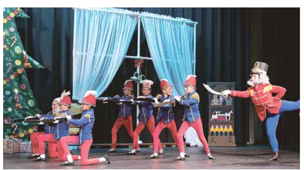
Students from the Mia Saunders School of Ballet perform the classic Battle Scene from "The Nutcracker."