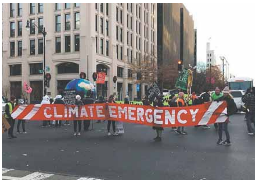
Strikers on the streets of D.C.