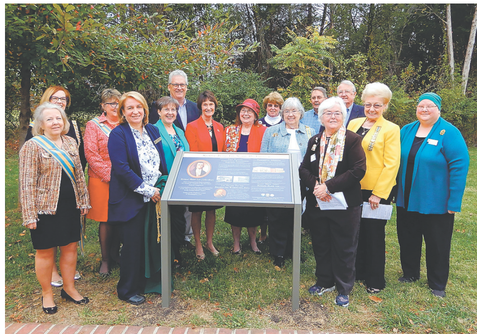
Fairfax County staff, Sully Historic Site staff, Sully Foundation members and elected officials unveil the new sign commemorating Richard Bland Lee.