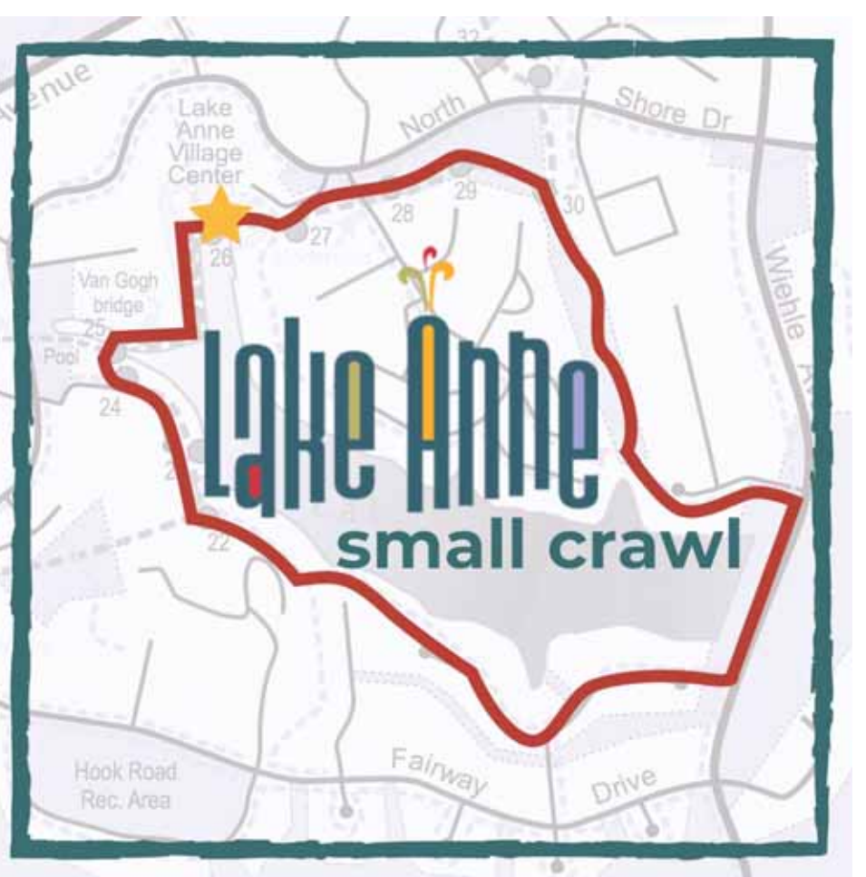
Do a Small Crawl around businesses at Lake Anne Plaza on Saturday, Nov. 30.

The Wonder of the Season. 4:30 and 7:30 p.m. At Reston Community Center at Hunters Woods, 2310 Colts Neck Road, Reston. Join The Reston Chorale for The Wonder of the Season, featuring Vivaldi's Gloria, family holiday favorites and a very special guest. Children 17 and under admitted free, but tickets are required. Tickets are $0 to $25. Visit www.RestonChorale.org.