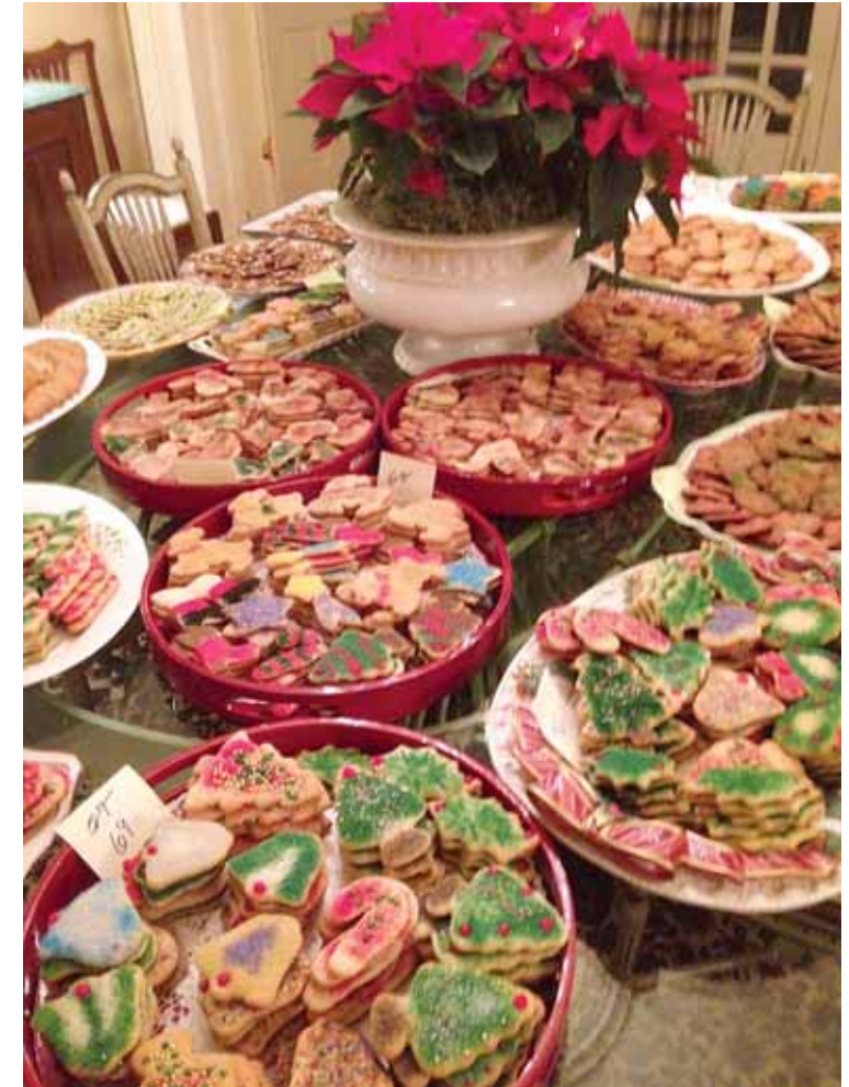
Baking holiday cookies with her son when he was four, became a family tradition that continues today.

Advanced planning might be necessary for parents who tend to find preparing for a holiday meal stressful. "When you're are in a frenzy to get the meal cooked before guests arrive, it might seem easier to do it yourself than have your kids