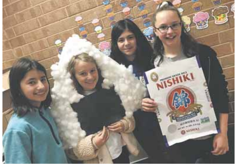
Sixth graders enjoyed the event. Nishiki donated the ingredients for Onigiri Action.

dren in need around the world via Table for Two and sponsoring organizations. Students in kindergarten learned about Onigiri for the first time, and all students at Fox Mill enjoyed making and eating Onigiri while supporting underprivileged children. This is the third year that Fox Mill has participated in Onigiri Action.