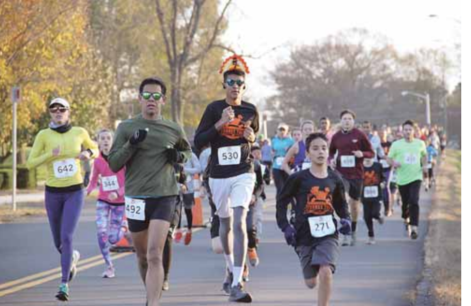
The Herndon Turkey Trot race will take place on Saturday, Nov. 23 at the Herndon Community Center.

Small Crawl. At Lake Anne Plaza, 11402 Washington Plaza, West, Reston. Start with a group "Crawl" (walk) around Lake Anne starting at Bronze Bob and then visit participating businesses to sample what they have to offer with a "small" selection. Bring your friends, family, kids and pets. Walk off your Thanksgiving meal and have a fun filled and delightful day. Participating businesses: • Teapot & Cake – Snowflake cupcake $1 • Reston Historic Trust & Museum – Reston Sticker – free. • Chesapeake Chocolates – Free wine tasting and Virginia treats 12 – 3 p.m. and $1 Chocolate all day long. Write a letter to Santa at the North Pole Mailing station • Reston Used Books Store– 50% short stories • Lake Anne Brew House – 1/2 price off of your first "Small Pour" (5 oz. size taster) • Lake Anne Coffee House & Wine Bar – Small cookie for sale. Visit http://lakeanneplaza.com.