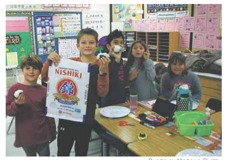
Students pose for a picture with their rice balls in Daiten sensei's classroom.