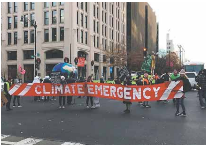
Strikers on the streets of D.C.