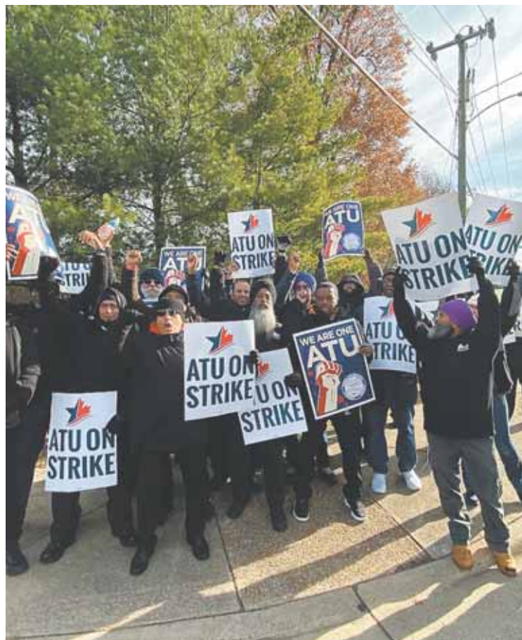
Amalgamated Transit Union Local 1764 Transdev workers picket in Herndon Friday morning, Dec. 6.

According to the Resolution: “In exchange for providing $154 million annually to the Washington Metropolitan Area Transit Authority for State of Goods Repair needs, the Virginia General Assembly imposed a 3 percent cap on increases to WMATA’s annual operating budget. ... WMATA’s management has used, or is considering using, a variety of strategies to reduce annual operating costs, including