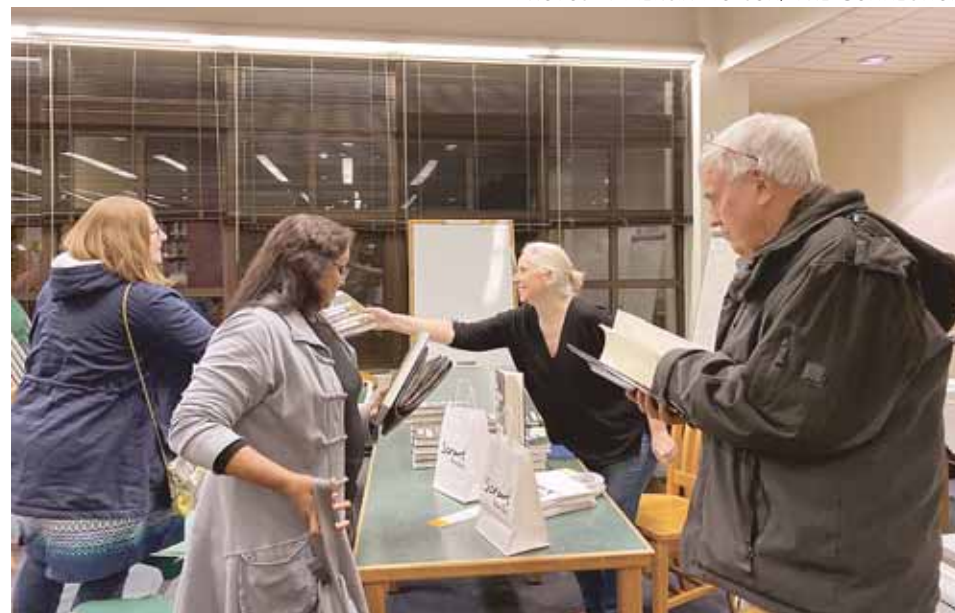
Patrons line up to purchase Klare's book "All Hell Breaking Loose: The Pentagon's Perspective on Climate Change."

bases. He conducted interviews with current and retired officers and asked them what the highest priority of the U.S. military was today