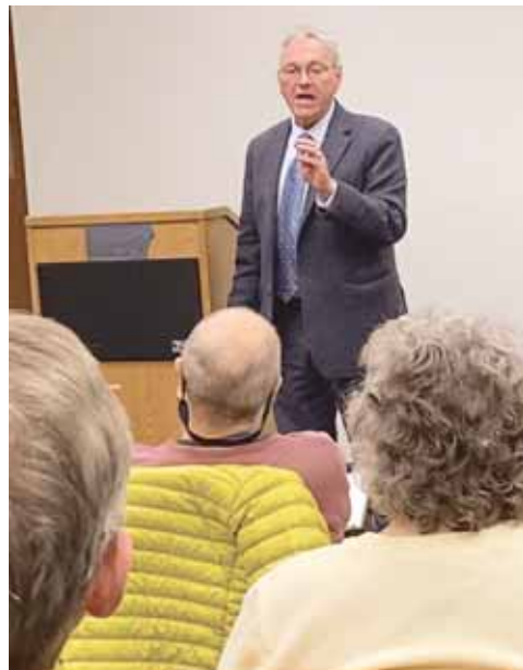
Author Michael T. Klare answers questions during the book discussion for his newly released examination of climate change, "All Hell Breaking Loose," held at Reston Regional Library Nov. 14.

"I discovered the U.S. Department of Defense (DOD) was also researching the same topic... That got me very interested. Why is the DOD so interested in climate change and its consequences... this isn't exactly a military matter," he said. According to Klare, he spent the last five years researching the Pentagon's study of climate change and its impact on U.S. national security. He visited