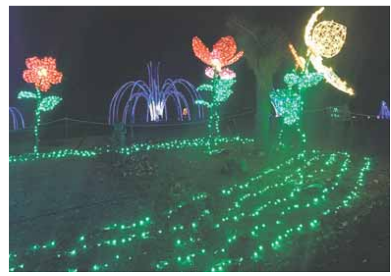
2019 Winter Walk of Lights Hours runs until Sunday, Jan. 5, 2020 (including holidays)