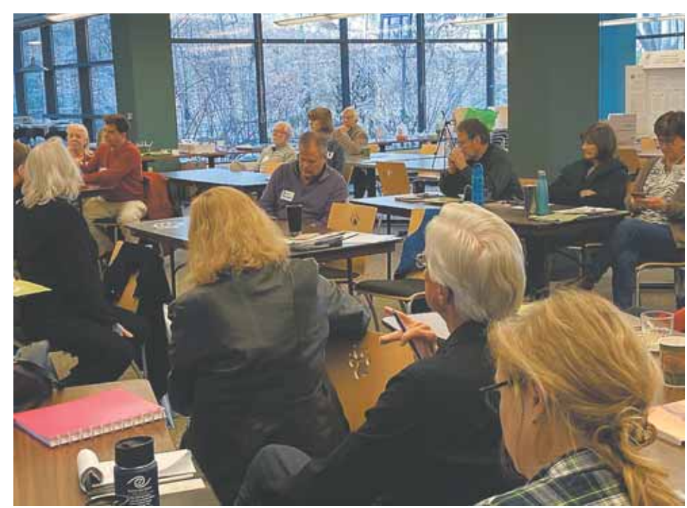
During the Reston Watch Party of the Virginia Conservation Network's 2019 General Assembly Preview, attendees discuss collective approaches to advancing priority environmental policy in the upcoming state legislative session.