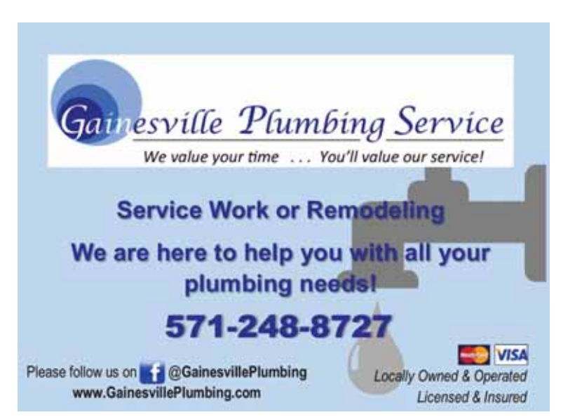
Inside or out...

1205 Dolley Madison Blvd. | McLean, VA 22101 | umtrinity.org