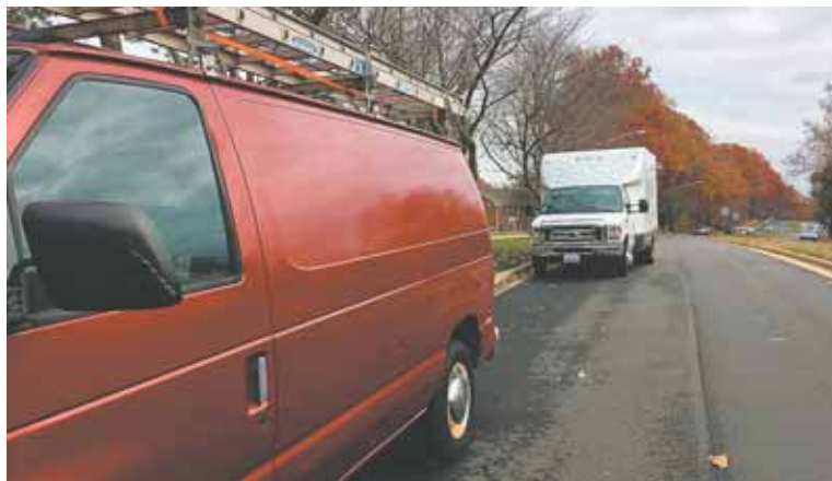
The vehicles come in all shapes and sizes.

"Community Parking District," and vehicles that exceed size and weight limits are not allowed. This is a truck or van more than 21 feet long, more than 8 feet high including appurtenances, width of 102 inches or more, or gross vehicle weight of 12,000 or more pounds.