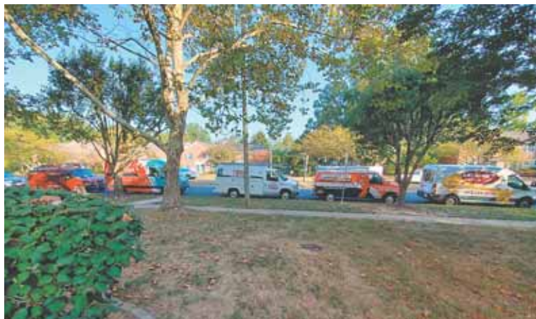
Vans and trucks with colorful paint jobs with ladders and phone numbers are an eyesore to some neighbors but not illegal.