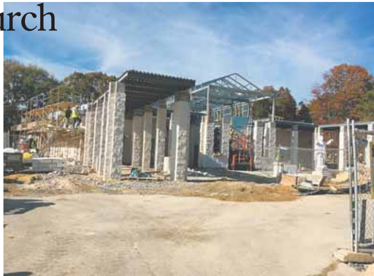
Lots of work underway at St. Lawrence Catholic Church.

At St. Lawrence Catholic Church, there is daily services, and