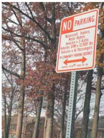
There are parking signs on Forrester but the vans seem to be within the acceptable limits.

HERRITY is working with the condo and civic association offi-