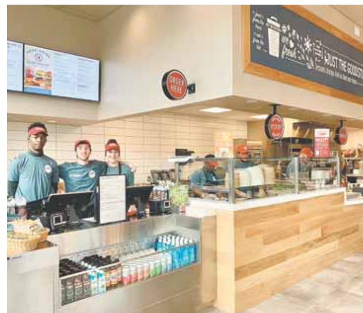
B.GOOD team members prepare for the grand opening.