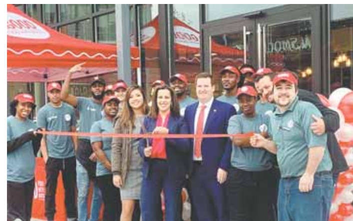
The Tysons Regional Chamber of Commerce and B.GOOD leaders at the grand opening’s ribbon-cutting ceremony.