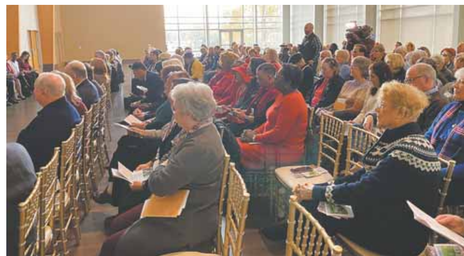
People from across Northern Virginia, the District of Columbia, Maryland and the nation listen to remarks held during the Suffragist Memorial Groundbreaking on Night of Terror Anniversary.

fully picketing outside the Woodrow Wilson White House for the right to vote. "There, they were humiliated, kept in inhumane conditions, tortured, locked in solitary confinement, and brutalized."