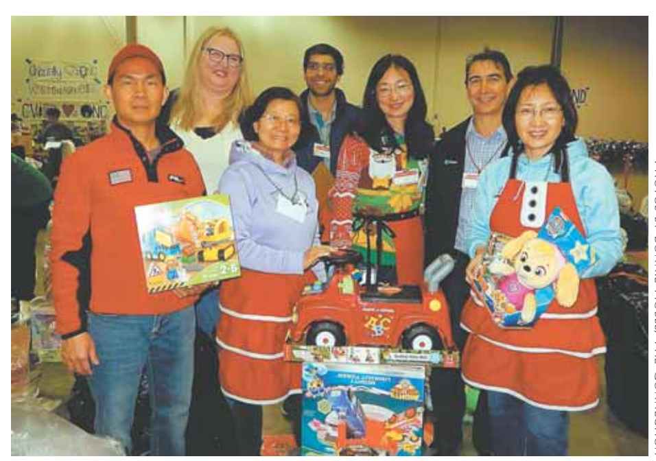
Filling families' gift bags with new toys is this group from Salesforce.com.