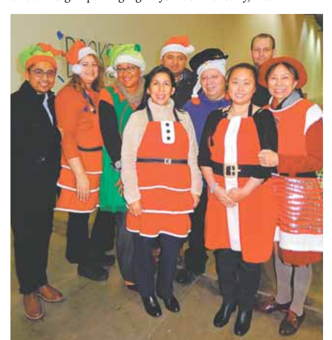
Lending a hand are these staff members from the Hilton Garden Inn in Fair Oaks.

Our Neighbor's Child (ONC) is in its 28^{\rm th} year of bringing holiday joy to hundreds of local families in need. And one of its gift-packaging days was Thursday, Dec. 12.