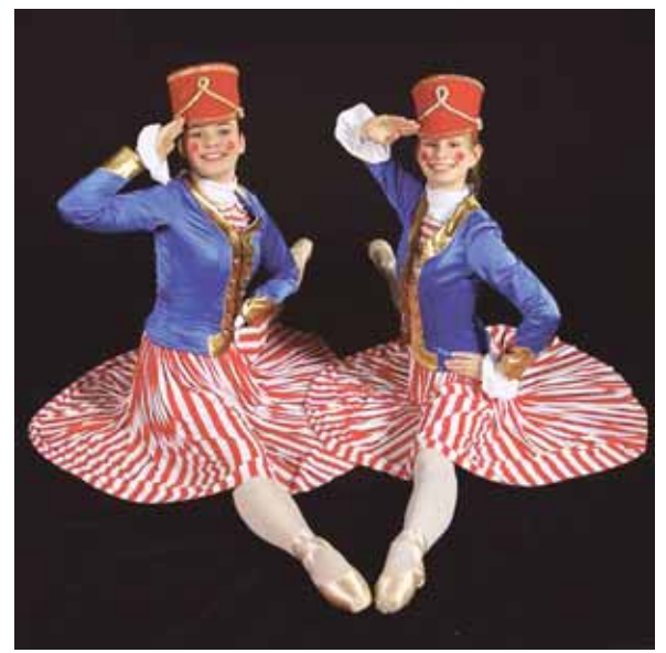
The Virginia Ballet Company and School will present "The Nutcracker" on Dec. 27-29 at NOVA's Annandale Campus.

Dec. 27-29, 2 p.m. and 7 p.m. At Northern Virginia Community College Annandale Campus, Ernst Community Cultural Center. The Virginia Ballet Company and School will present its 70th season of the classic "Nutcracker." Ticket prices for reserved seating are $30 for adults and $20 for children, students and seniors, plus a $3 fee per each ticket. Tickets may purchased online www.vaballet.org. Group pricing for these 6 performances is available for groups of 10 or more for the same performance. Call 703-249-8227. The box office opens one hour before per-