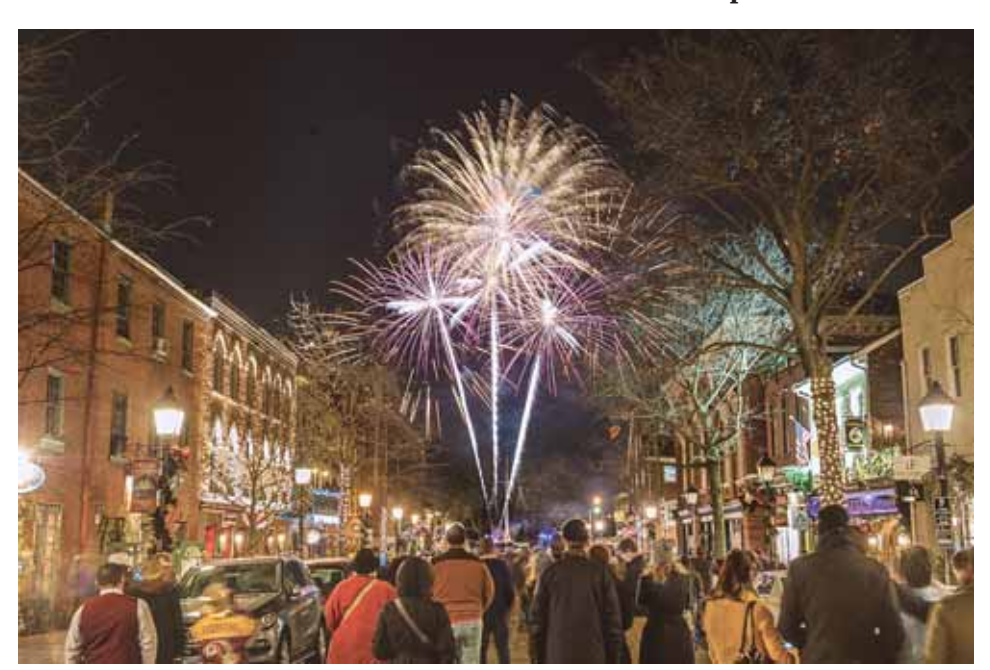
The 25th Anniversary First Night in Old Town Alexandria takes place Tuesday, Dec. 31.