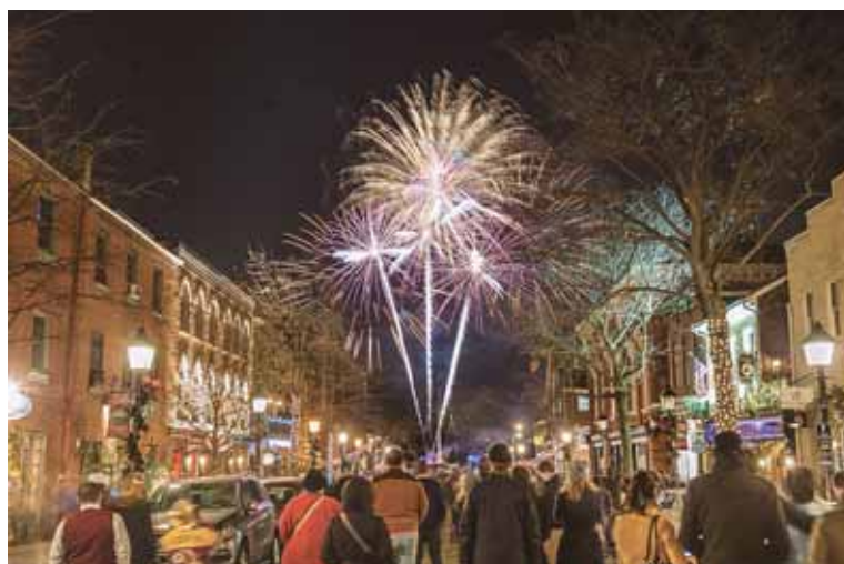
The 25th Anniversary First Night in Old Town Alexandria takes place Tuesday, Dec. 31.

Bridge Tournament. Noon to 5 p.m. At Christ the King Lutheran Church, 10550 Georgetown Pike, Great Falls.