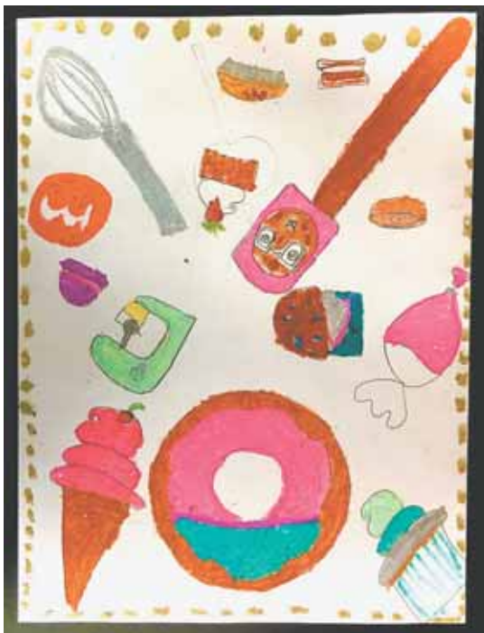
Caroline Crook, Grade 5