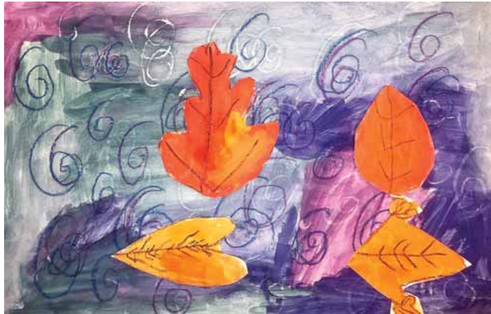
By Georgi Bu, Grade 1, Orange Hunt Elementary