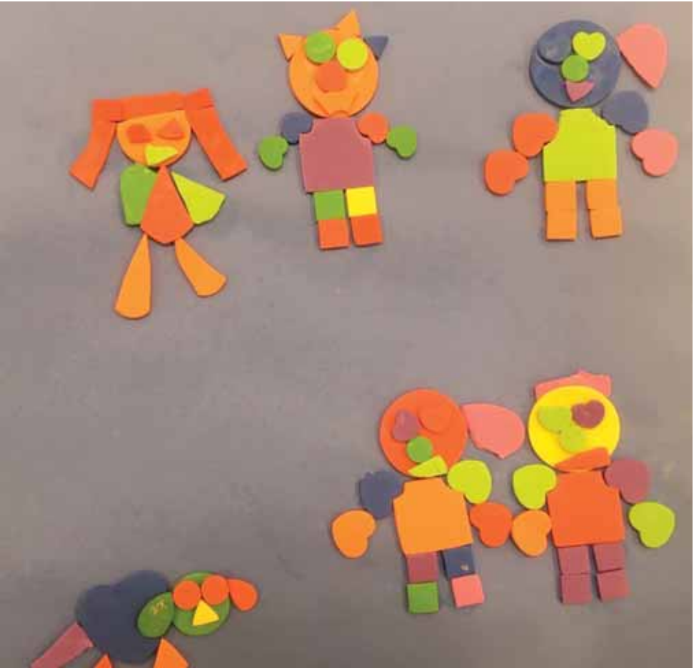
By Catherine Foley, Grade 1