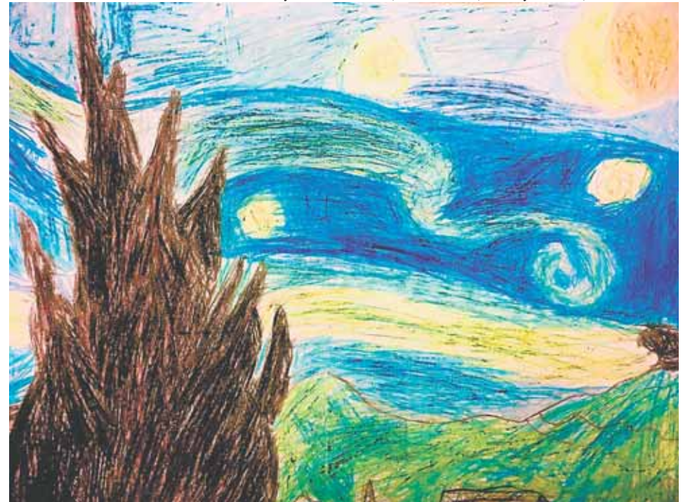
Oliver Glas, Grade 5