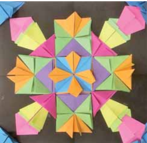
By Akaysha Higdon, Grade 5