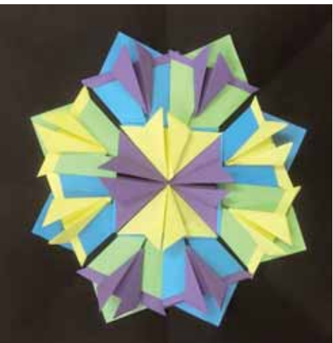
By Olivia Root, Grade 5