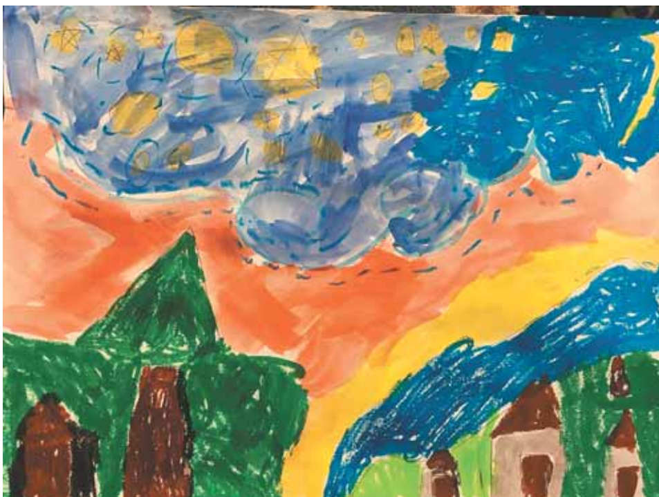
Sophie Seigle, Grade 1, Cherry Run Elementary