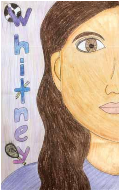
By Whitney Moffa, Grade 6, Orange Hunt Elementary