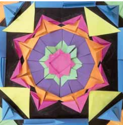
By Jack Launey, Grade 5