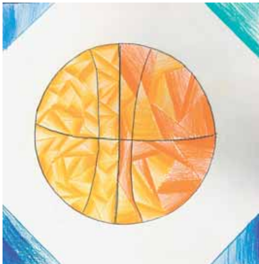
Palmer Wade, Grade 6