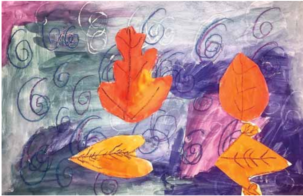
By Georgi Bu, Grade 1