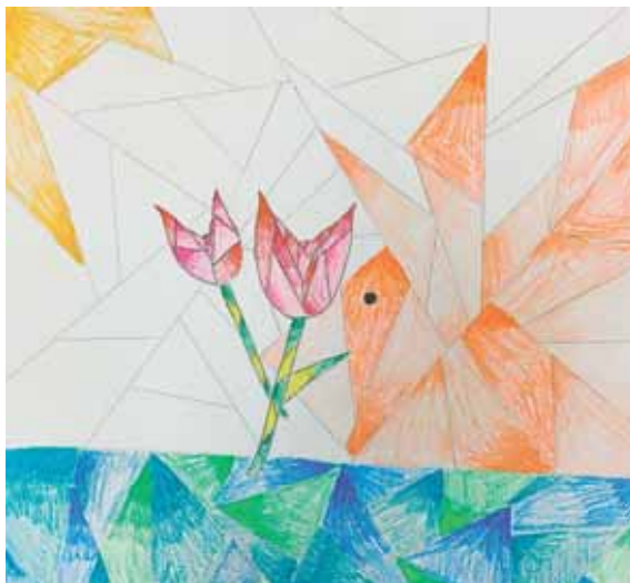
Kyla Tran, Grade 6