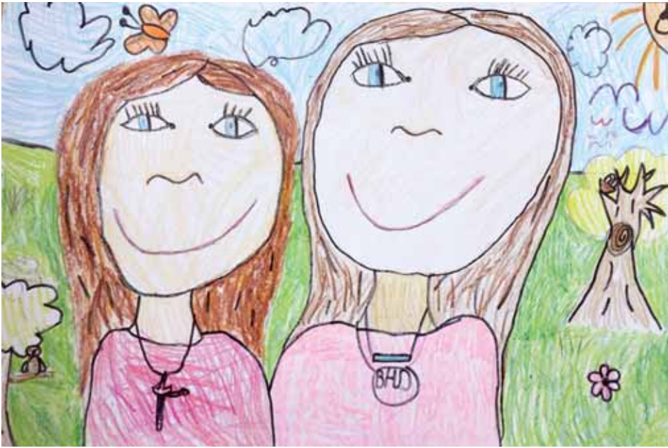
By Darby Quill, Grade 2