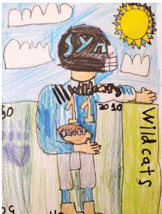
By Aedan Buchanan, Grade 5