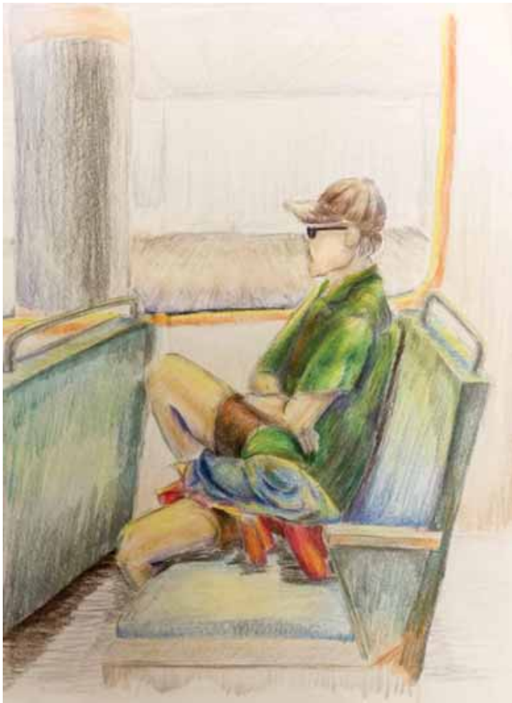
Summer In Metro 2