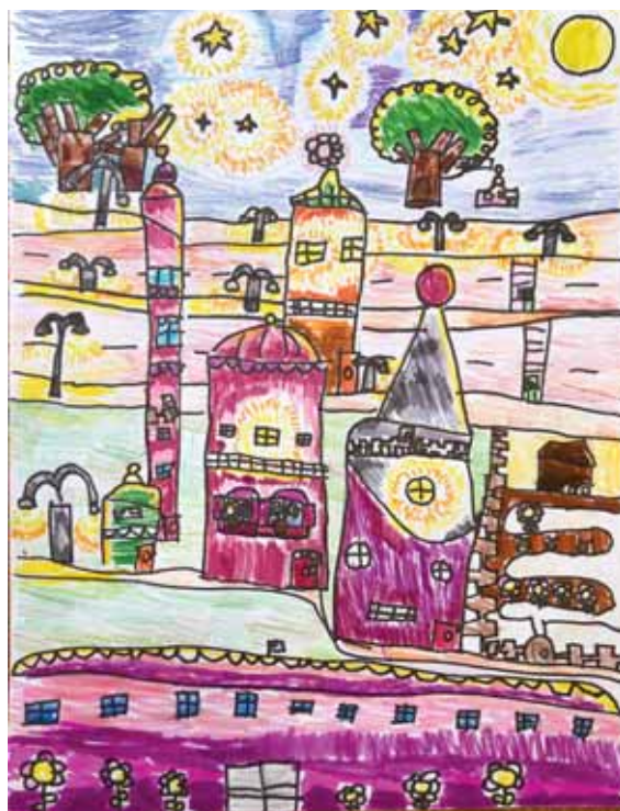
By Serena Pan, 8, Centreville, Poplar Tree Elementary, Grade 2.