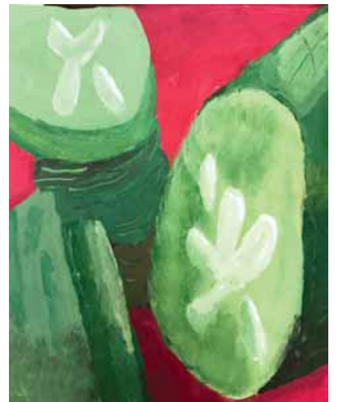
Grade 5, Vivi B.