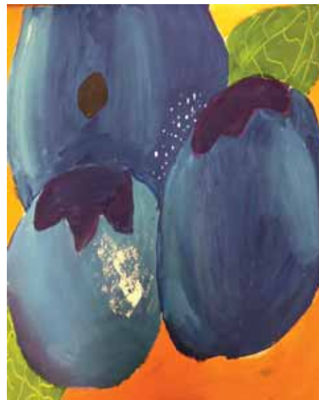
Grade 5, Sophia Y.