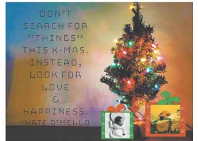
By Medha Gudepu, Grade 5