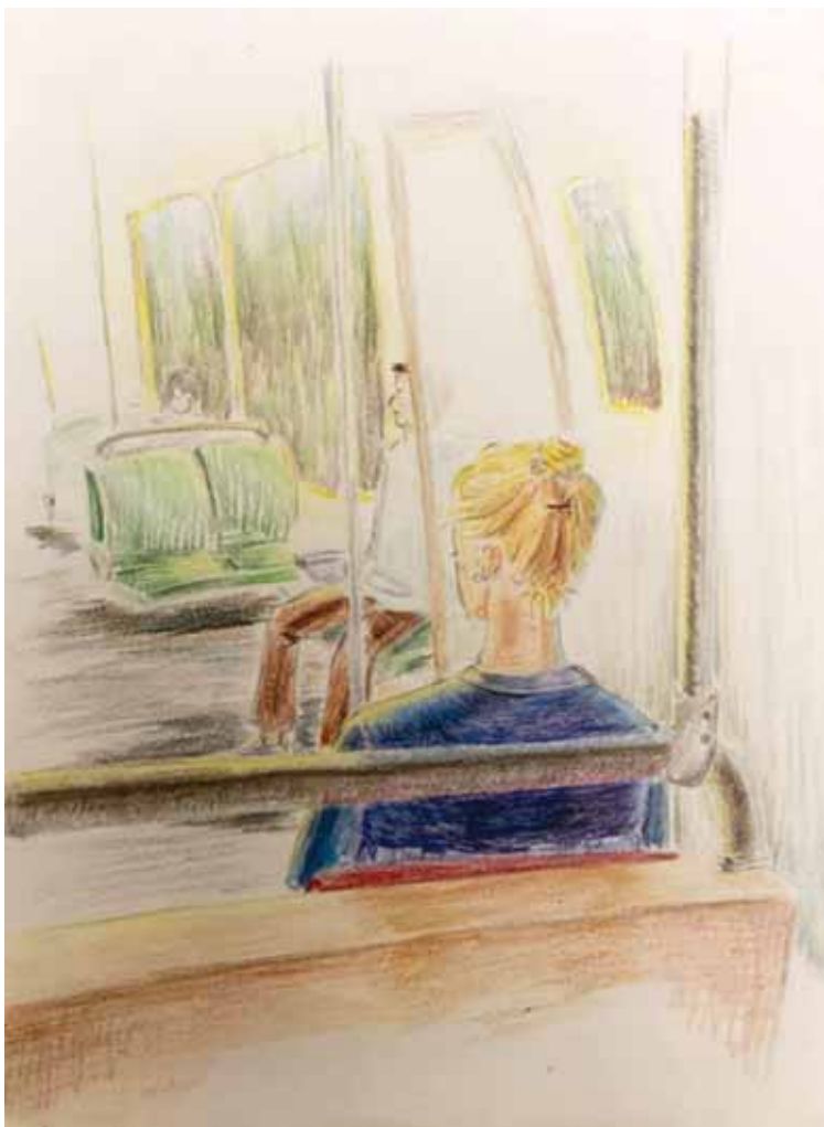
Summer In Metro 1