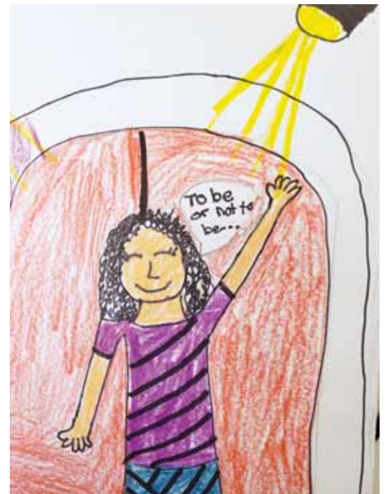
By Gwen Eagle, Grade 6