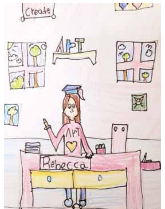
By Saavni Aggarwal, Grade 6