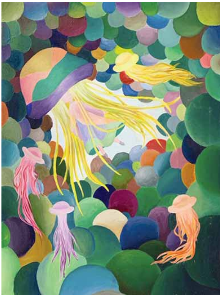
A Tranquil Dream