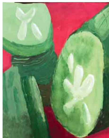
Grade 5, Vivi B.