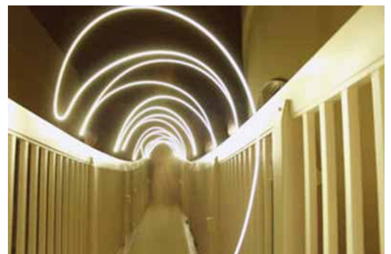
A long shutter speed and flashlight is used to create this memorizing light picture.