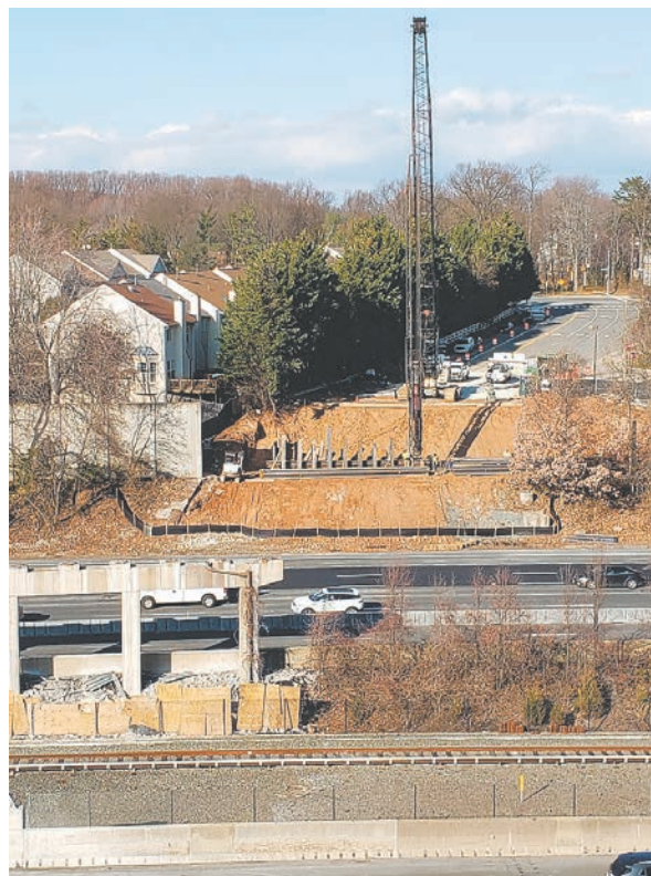
With the houses so close, the overnight bridge destruction at Vaden Drive generated some complaints.

It’s much of the same at the Chain Bridge Road (Route 123) interchange, except the adjustments for the bike trails that are part