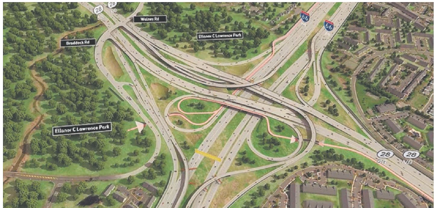
When completed, the Route 28 interchange will be more free-flowing than it is now.

The Route 28 interchange along I-66 in western Fairfax County is a big part of the project. Drivers on Route 28 heading north, and trying to get to I-66 east have a more