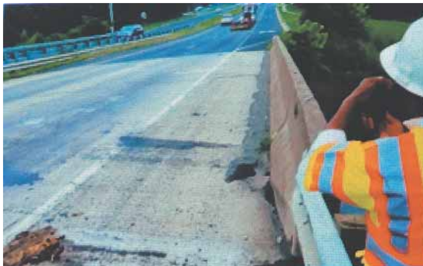
This photo shows the existing conditions on the bridge deck.

For more information, go to www.virginiadot.org/projects .