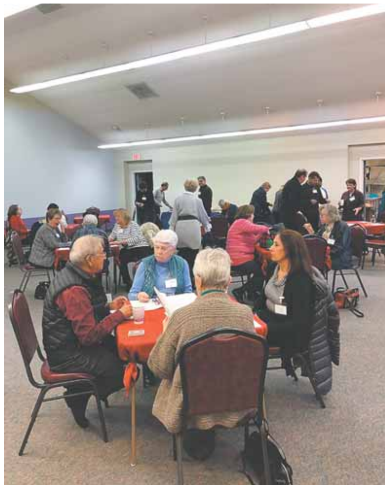
Players chat and share light refreshments with one another before the tournament begins.