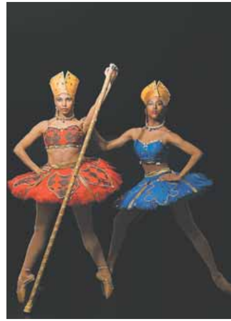
Chicago's Hiplet™ Ballerinas will perform at The Alden at 6 p.m. on Saturday, Jan. 25.

formance is at 7 p.m. on Thursday, Jan. 30. The Alden is the only DMV stop in the 40-city "We Shall Overcome" tour, and the acclaimed Howard University Gospel Choir is featured. Tickets are $45 for the general public, $25 for seniors and students and $20 for MCC tax district residents.