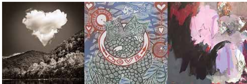
The show “All You Need is Love will be held at Mosaic in Fairfax.

G-Scale Model Train Show. 1-4 p.m. At Fairfax Station Railroad Museum, 11200 Fairfax Station