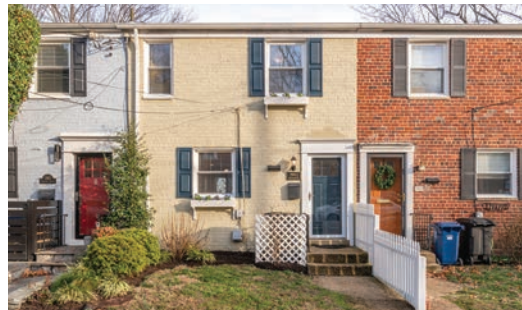
2911 Sycamore Street OPEN SAT & SUN 2-4PM | $650,000