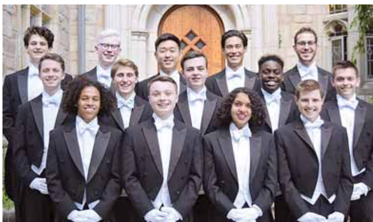
The Yale Whiffenpoofs will perform on Friday, Feb. 7 at the George Washington Masonic National Memorial.

Swing Gadjó. 6 p.m. At The Athenaeum, 201 Prince Street,