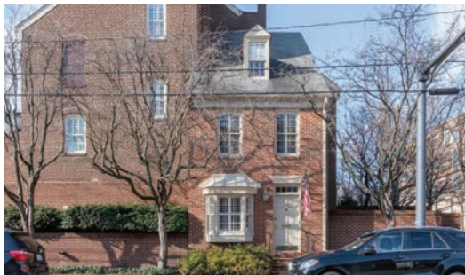
576 N Saint Asaph Street PENDING | $665,000

We have a proven track record of representing buyers and sellers in a competitive marketplace.