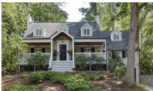
502 Kentucky Avenue SOLD | $1,200,000