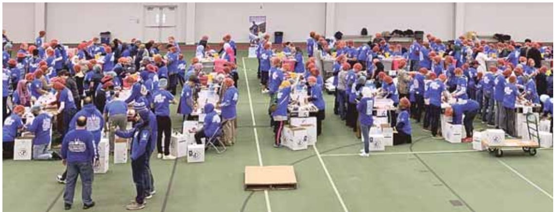
More than 300 Islamic Relief USA volunteers package meals for distribution to food banks during the Jan. 19 day of service at Episcopal High School in honor of Martin Luther King Jr.