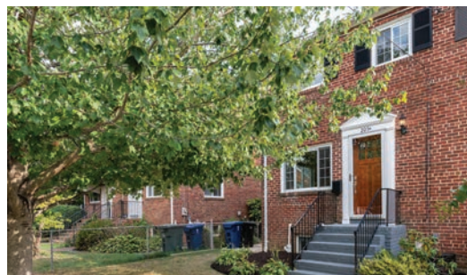
205A E Spring Street SOLD | $681,200