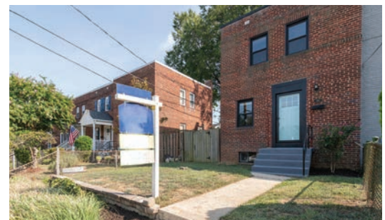
415 Laverne Avenue SOLD | $610,000