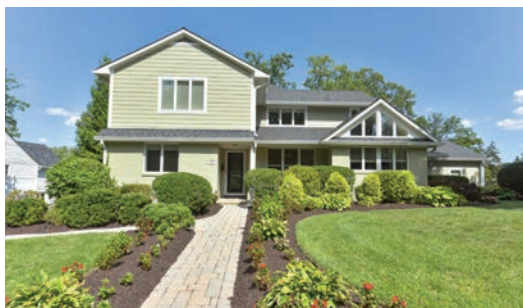
3001 Edgehill Drive SOLD | $1,220,000