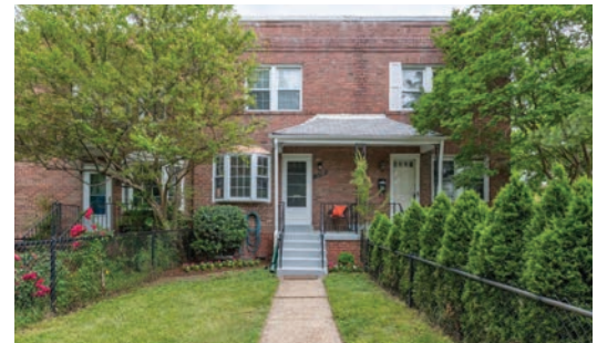
570 E Nelson Avenue COMING SOON | $689,900