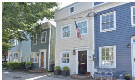
418 Gibbon Street SOLD | $735,000