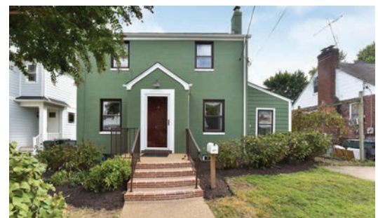
417 E Custis Avenue SOLD | $769,900

With more than 35 years of experience and over $102 million sold in 2019, The Jen Walker Team brings you unparalleled knowledge, expertise, and customer service to streamline your home buying process.