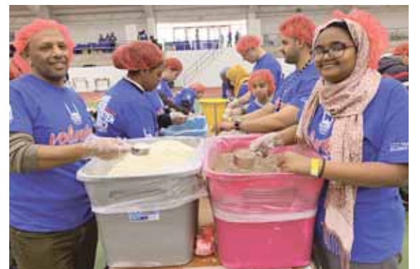
Islamic Relief USA volunteers prepare jambalaya packages during the Jan. 19 Day of Service at Episcopal High School.